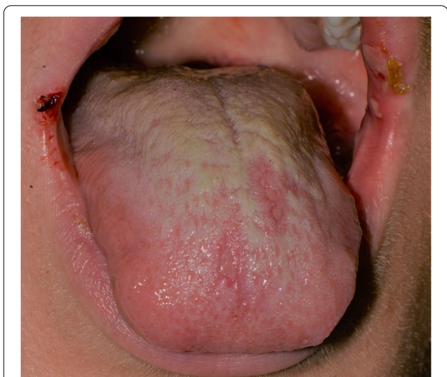
Fig. 17 Erythematous lesions on the dorsal tongue mucosa