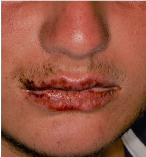
Fig. 9 Erythematous and squamous crusted lesions on lips mucosa and vermillion