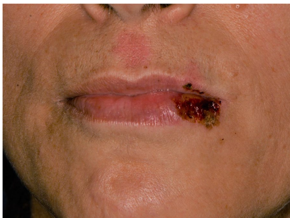
Fig. 1 Squamous crusted lesions and erythematous areas on lips mucosa and vermillion

She has been treated with prednisone 25 mg p.o. a day for 10 days tapering the dosage and topical 0.05% clobetasol propionate ointment. Thereafter discontinuation of corticosteroid-based therapy, a dosage of BP180 and BP230 with the enzyme-linked immunosorbent assays (ELISA) method was asked, to rule out MMP recurrence due to the medical history of the patient. The ELISA test resulted negative. The diagnosis of EM minor was posed. After 10 days of therapy, the lesions disappeared without reoccurrences.