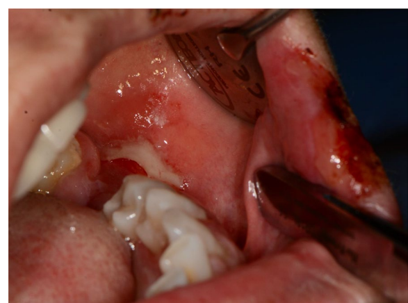
Fig. 3 Bullous-erythematous lesions on the left cheek mucosa