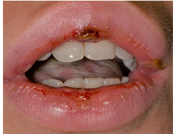
Fig. 14 Squamous-crostous and bullous lesions on the lip's mucosa