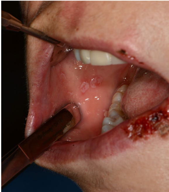
Fig. 4 Bullous-erythematous lesions on the right cheek mucosa