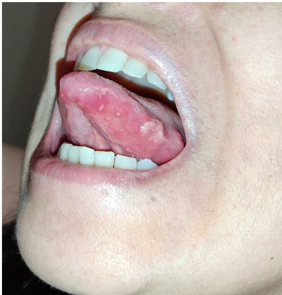
Fig. 13 Multiple bullous and erythematous lesions on the ventral tongue