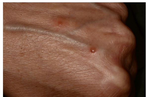
Fig. 8 Erythematous and bullous lesions on dorsal hand skin