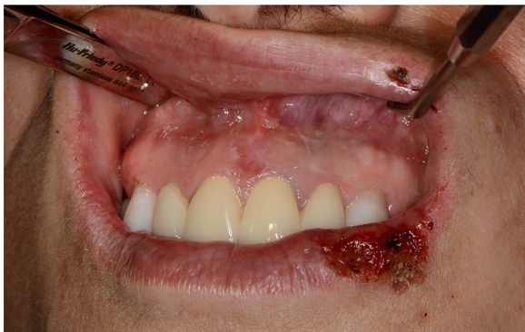
Fig. 5 Erythematous lesions on the gingival mucosa