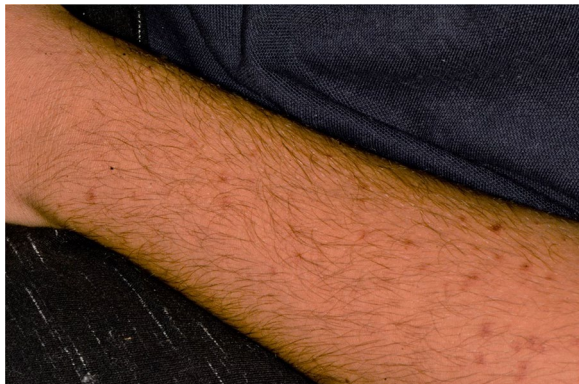
Fig. 10 Multiple erythematous skin lesions

report any change in his usual epilepsy medical treatment, consisting of valproate.