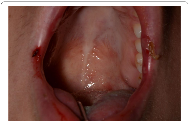
Fig. 19 Erythematous lesions on the soft palate

usually arose within 7 days from the injection: local manifestations appeared within 1–3 days from the inoculation while systemic reactions were noted 7–8 days after vaccination [4].