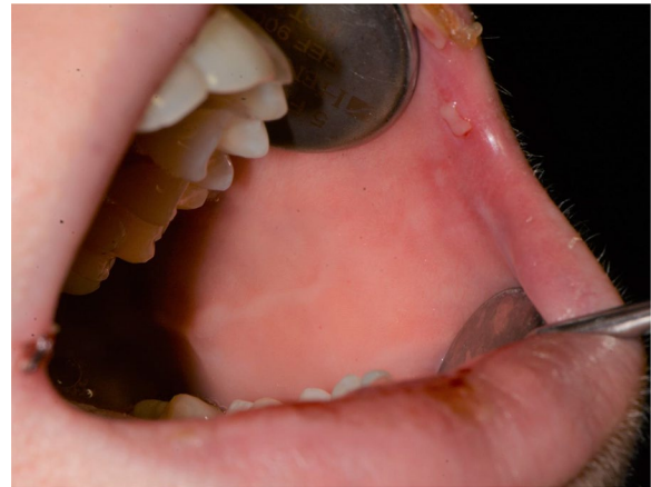
Fig. 15 Bullous and erythematous lesions on the cheek and inner lip's mucosa