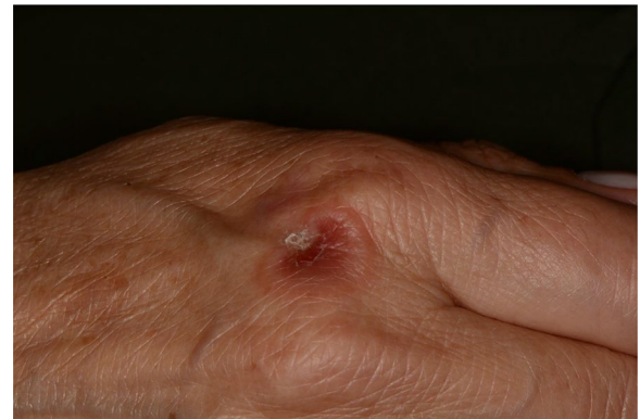
Fig. 7 Typical target erythema multiforme lesion on dorsal hand skin