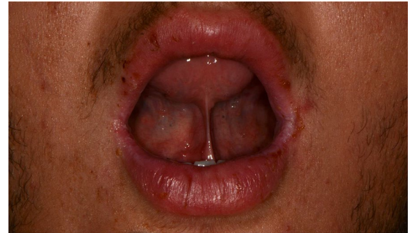
Fig. 11 Improvement of labial and mucosal lesions after prednisone treatment

When the patient presented to our attention, he was prescribed with prednisone 25 mg p.o. a day tapering the dosage, in association to topical 0.05% clobetasol propionate ointment. After a week of treatment, the patient showed regression of mucosal and cutaneous lesions (Fig. 11).