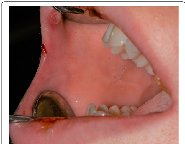
Fig. 16 Bullous and erythematous lesions on the cheek and inner lip's mucosa