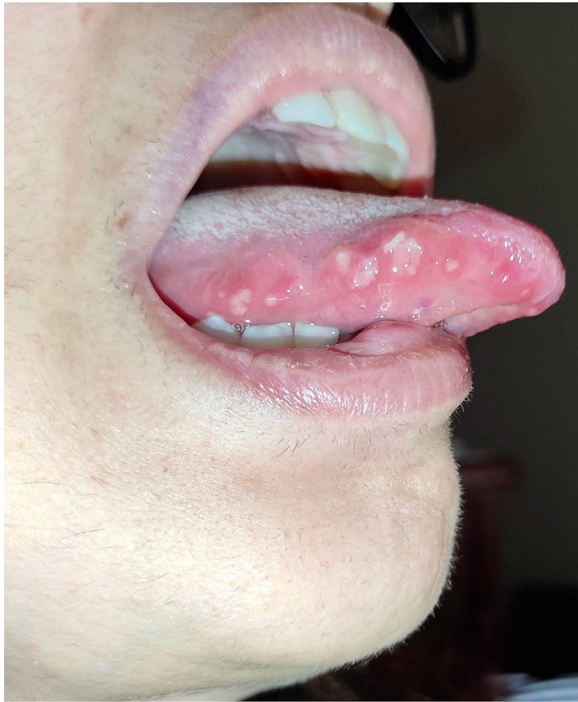
Fig. 12 Multiple bullous and erythematous lesions on the ventral tongue