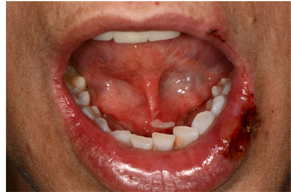
Fig. 2 Squamous crusted lesions on lips mucosa and bullous lesions on the mouth floor mucosa

Later, she also developed oral mucosa's painful erosive lesions, and concentric targetoid plaques on hands, forearms, knees, and heels (Figs. 1, 2, 3, 4, 5, 6, 7 and 8). The genital mucous membranes were not involved. Before the first dose vaccination, the patient was in apparently very good health, with no recent story of herpes labialis and