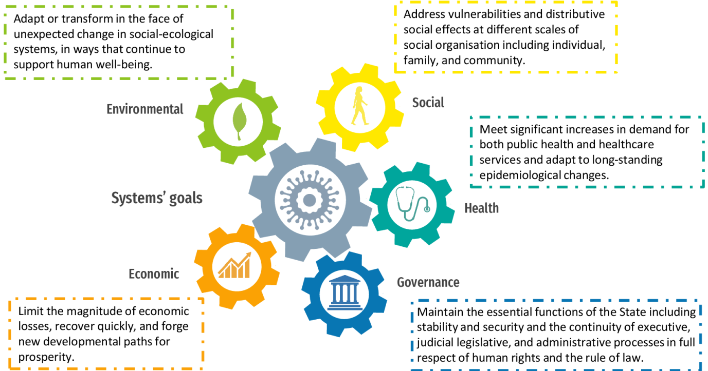
Figure 1 Interconnected societal systems and their different goals in addressing the COVID-19 pandemic.

governance functions and minimising any undesirable systemic effects. This definition encompasses the capacities of societies to (1) prepare, prevent and protect before disruption; (2) mitigate, absorb and adapt during disruptions; and (3) restore, recover and transform after disruption. 6