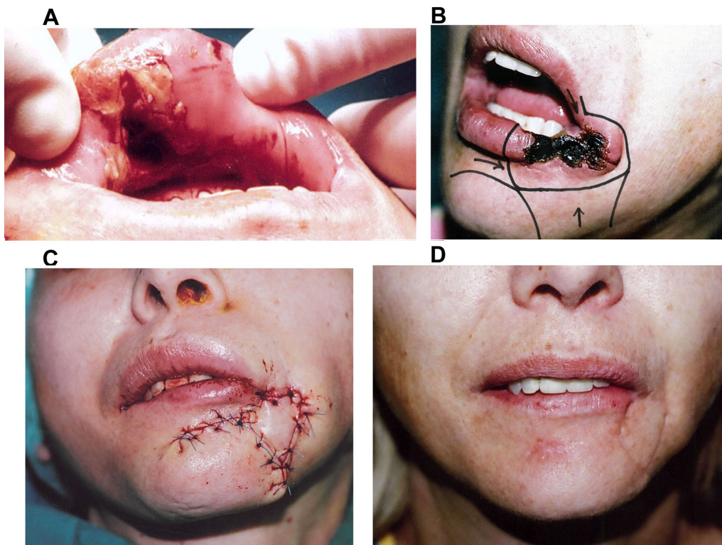
FIGURE 1. (A) Ulcer-necrotic changes of the mucosa and muscles of the lower lip. (B) A segment of the lower lip and oral commissure affected by necrotizing inflammation, and a reconstruction plan for the formation of two advancement flaps. (C) Immediate postoperative view. (D) The result of reconstruction after three months. The lip is symmetrical with a natural color and texture of the vermillion.

A long medical history of celiac disease was recorded, with occasional oral manifestations of recurrent aphthous stomatitis. As a child, the patient contracted chickenpox and measles. In the months before admission she felt muscle weakness and difficulty moving. She was being treated for an anxiety-depressive disorder. Regarding medications, she was taking only Xanax. Her appetite was poor and she was consuming an unbalanced diet. In the last two-three months, she experienced bloating with alternating constipation and profuse diarrhea. The patient denied acute and chronic respiratory diseases, skin, genital and perianal changes, orogenital contact and sexual activity, eye problems, photosensitivity, and arthralgias. She did not experience mechanical, chemical, and thermal trauma to the oral cavity before the ulcer appeared, nor did she injure herself. Her menstrual