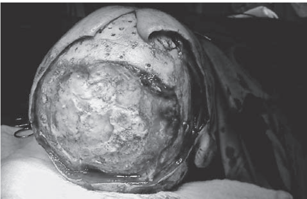
Figure 2b. Operative view. Bone involved.