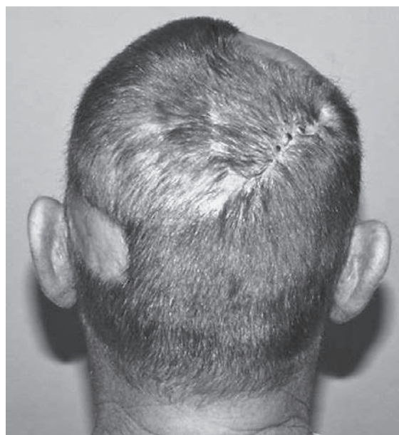
Figure 1b. Defect reconstructed with local flap. Postoperative view.

taken indicate that the chosen methods of reconstruction of scalp and calvaria defects were successful. Today local flaps are the standard method of reconstruction of such defects and are recommended by numerous authors, who have published the results of their experimental studies (13,14). Our experience and successful results corroborate the opinion of Guerissi et al. who reported successful treatment of large scalp defects of up to 60% of the surface by the technique of local flaps and considered them to be a simple and safe method of reconstruction. They had no postoperative complications. Defects of the calvaria after resection were not primarily reconstructed (15). Mandell et al. and Tepavicharova et al. have good experiences with scalp flaps in reconstruction of large defects (10 %- 60 % of the scalp surface area). There were no postoperative complications (16, 17). In the case of acute deep burns we treated defects of the scalp and calvaria in a classical way, by necrectomy of the soft tissues and resection of the necrotic bones prior to covering by a local flap. Bizhko et al. performed necrectomy of the soft tissues only, without resection of the bones, and reconstructed scalp defects by axial flap in 22 patients with deep scalp and calvaria burns. Bone regeneration was satisfactory and confirmed by radiography (18). We reconstructed large defects of the scalp and calvaria by free microvascular