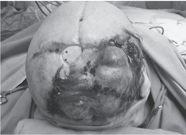
Figure 2a. Scalp defect caused by tumors. Preoperative view.