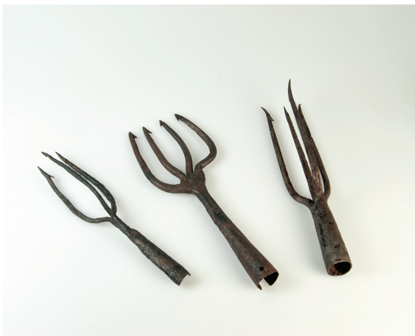
Fig. 3. Fishing implements from the Kupa River (photo: I. Krajcar) / Sl. 3. Ribarski pribor iz rijeke Kupe (snimio I. Krajcar)

prongs are not always parallel but they are always barbed. The specimen studied in this paper is the only one found in Siscia whose prongs are not barbed. How significant is this detail? Quite a lot, I would say: when a fisherman strikes the fish with a trident, the unfortunate animal is already as good as dead. While the fish is unlikely to survive such wounds, just being pierced does not imply that it will not try to disengage itself and escape. The fisherman still needs to ensure that his prey will not break away. This is precisely the role of the barbs which will remain stuck in the soft tissues. While our trident may have been used as a functional fisherman's instrument, it would have had a genuine construction flaw. Thus, one may wonder why a knowledgeable and experienced fisherman would have bothered catching fish with an imperfect tool.