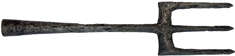
Fig. 2. Photography of the Kupa trident find / Sl. 2. Fotografija nalaza trozuba iz Kupe