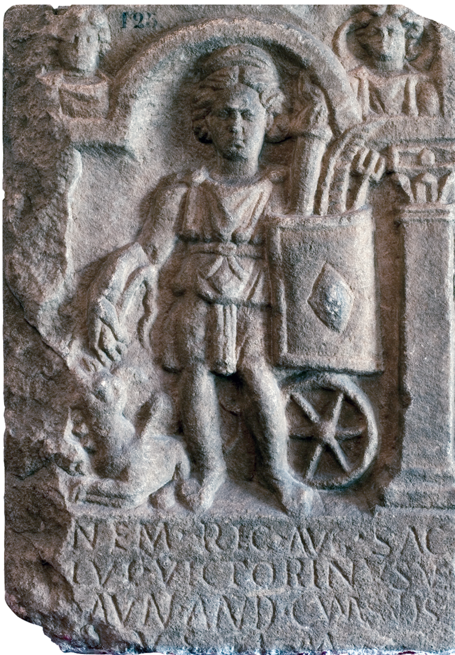
Fig. 4. Nemesis relief from Andautonia (photo: I. Krajcar) / Sl. 4. Reljef Nemeze iz Andautonije (snimio I. Krajcar)