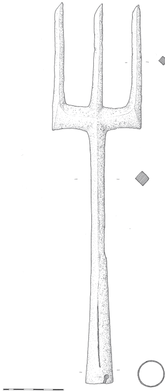
Fig. 1. Drawing of the Kupa trident find (made by M. Galić) / Sl. 1. Crtež nalaza trozuba iz Kupe (autorica: M. Galić)