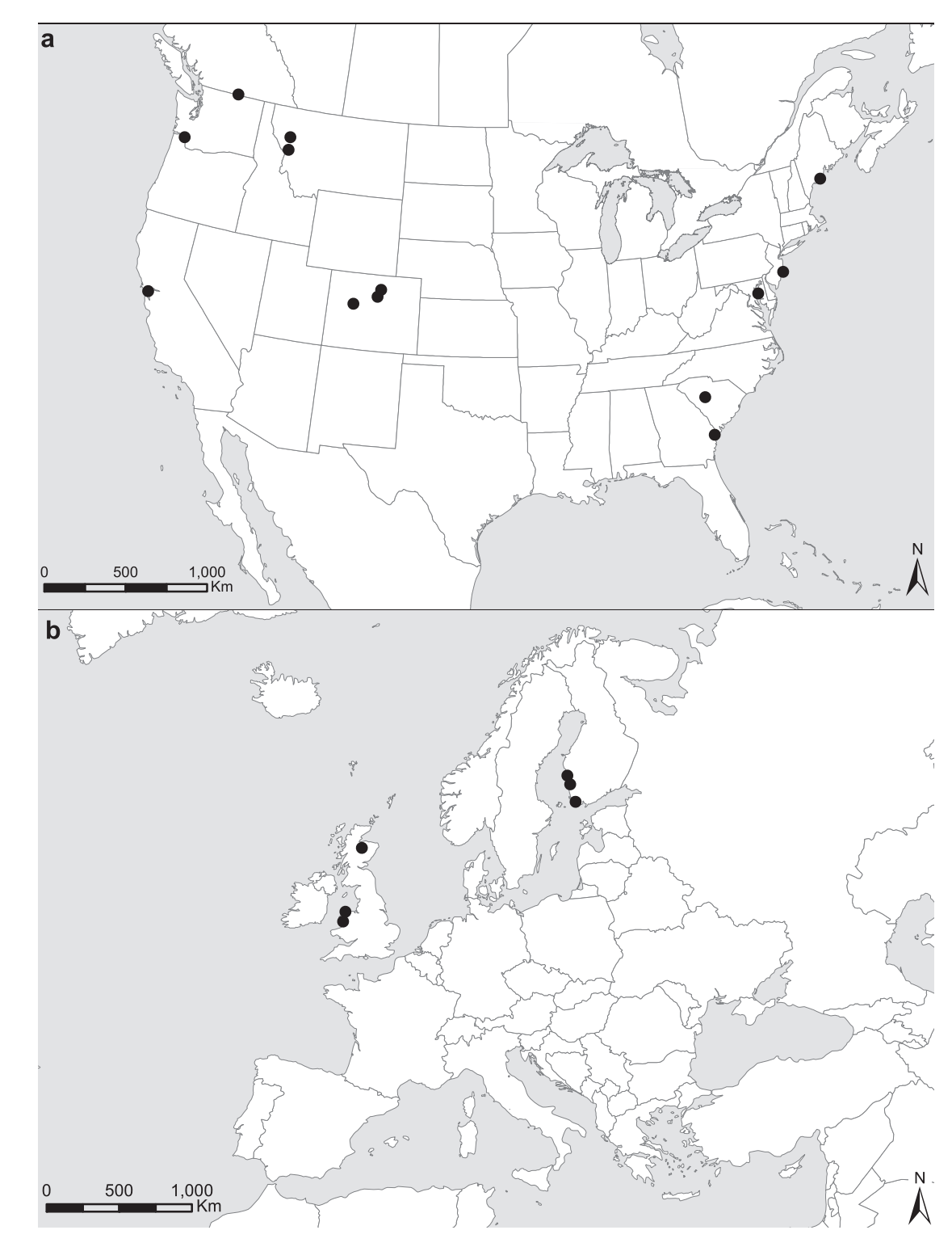
Figure 1. Locations of 19 Osprey nests and web cameras, representing data collected by citizen scientists for one to seven breeding seasons (2014–2020): (a) North America, (b) Europe.