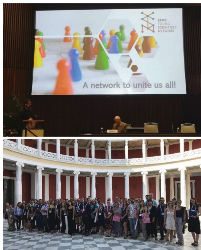
Figure 4. Top, Michele Mari presents the YSN to the participants of the 2019 ESMEC school; bottom, group picture at the closure of the 2019 EFMC-YMCS in Athens, in the courtyard of the historical Zappeion building.

The YSN members developed this idea further and established a program of “soft-skills trainings” for the EFMC-YMCS 2019 in Athens, Greece (Figure 4). They also continued networking aperitifs to encourage interactions with established scientists from universities, pharma, biotech companies and contract research organizations (CROs). From this point on, soft-skills training had become an established part of the EFMC-YMCS program.