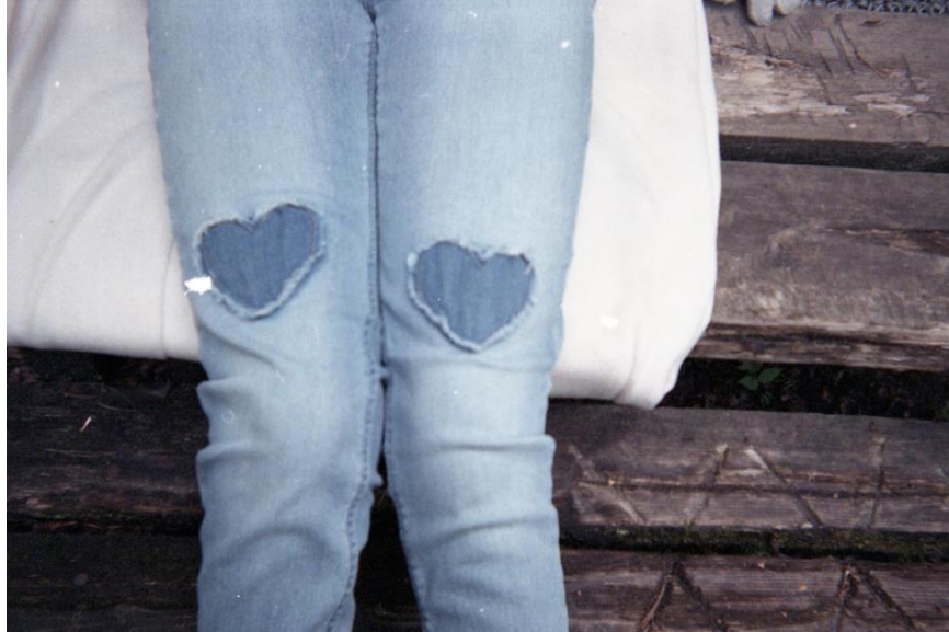
Image 12. From camera 61 by unknown participant. Love is in the air! All we need is love and empathy for places.

Two shades of blue, surrounded by 100 shades of blue.