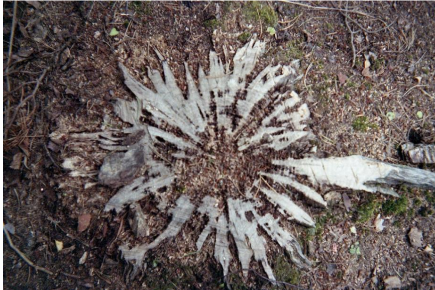
Image 9. From camera 47 by unknown participant. Details to tell a story, a maze where you can get lost or a memory of a tree that once was here? What is left of the wisdom and glory? Rooted into the ground, yet looking like a comet, a star with a long tail: are the same shapes and images repeated across the universe in different surroundings?

Before turning into black soil, the metamorphosis has a phase of noble bluish gray.