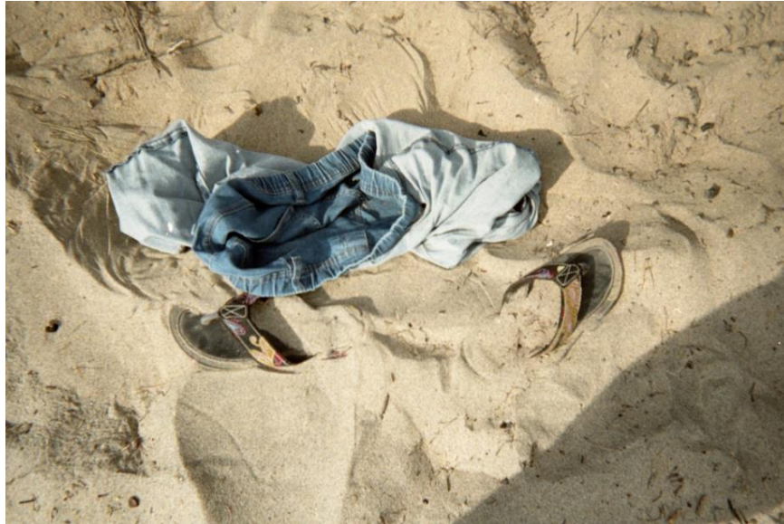
Image 5. From camera 35 by unknown participant. Liberated from your clothes! Surprising details in the landscape. Being liberated from your roles and clothes and escaping naked into the lake or the woods? Getting back to your roots and mother nature? There were several entries where cast aside clothes were left alone on the beach, banks and moss.

Blue jeans are casual, nakedness is natural.