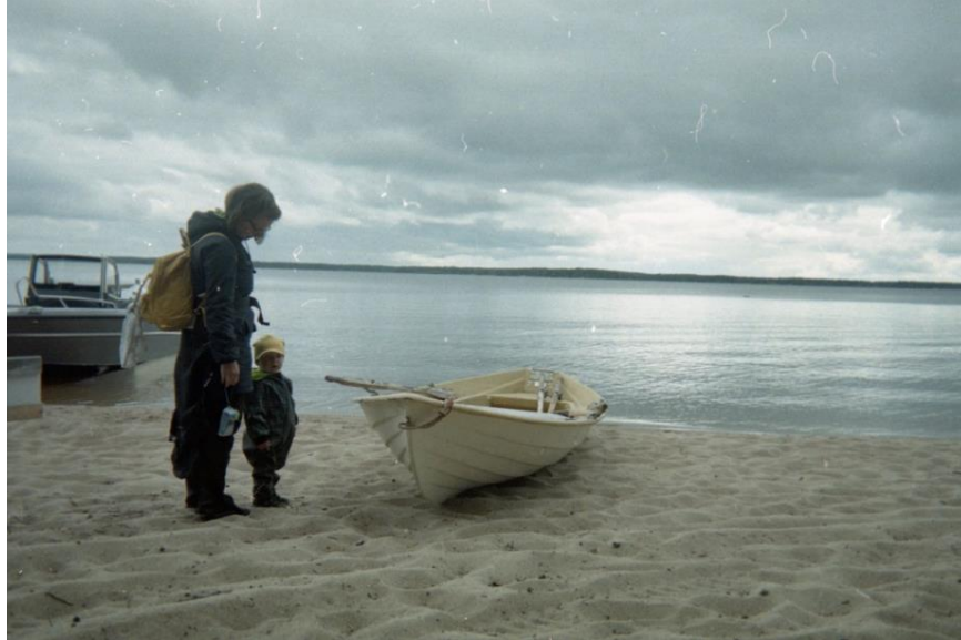
Image 7. From camera 82 by unknown participant. Departure and emotions. A mother can see only her child, not the place around, while the child is gazing out of the image toward the great unknown future.

The same shade of blue is in the water bottle and the lake and sky. Is it the same water in us and around us?