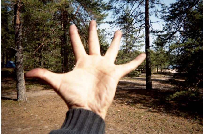
Image 4. From camera 2 by unknown participant. Suddenly noticing something new in yourself in relation to a place – how your hand communicates with the surroundings. Awakened in the sense of palmistry, that the lines in your hand match the paths of the place.