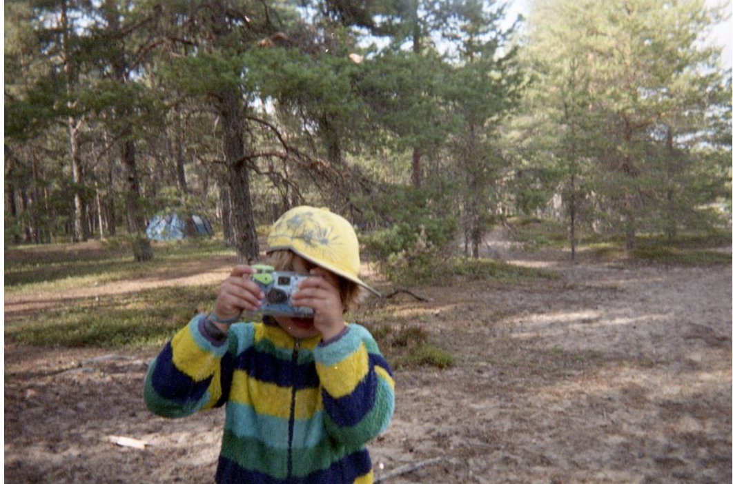
Image 2. From camera 74 by unknown participant. The toyish look of the cameras encouraged ease of engagement.

Blue was the color of the disposable cameras and matched the coat of this young photographer.