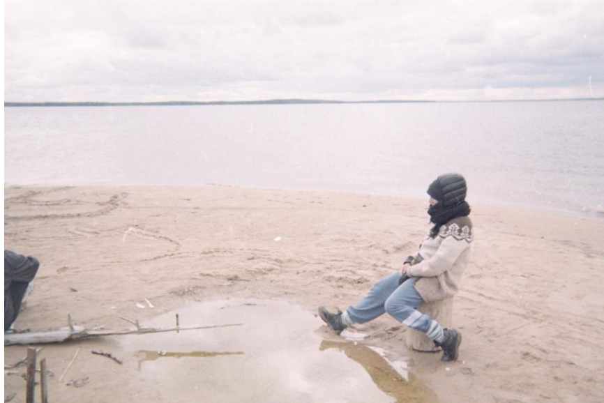
Image 6. From camera 54 by unknown participant. Camera 54, solitude. Solitude in the landscape. The most impressive collection was the 86 images depicting being still, small, and alone in the landscape. The proportions of the world slip into their place again and the human can feel small in the lap of the forest.

Blue-grayness surrounds us and affects our moods and emotions.