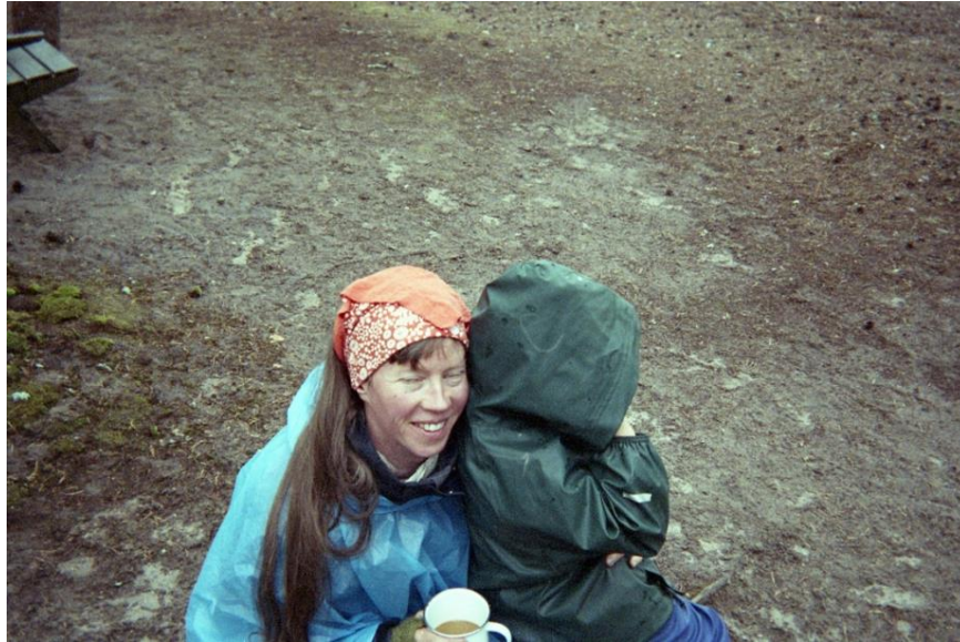
Image 11. From camera 70 by unknown participant. Love, devotion, hugs. Intimacy, warmth, not minding the weather, taking care, enjoying the simple things of life. The warmth of coffee and holding your dear one tight.

evolve place empathy, and through creating positive visual engrams we might be able to change the perception of places.