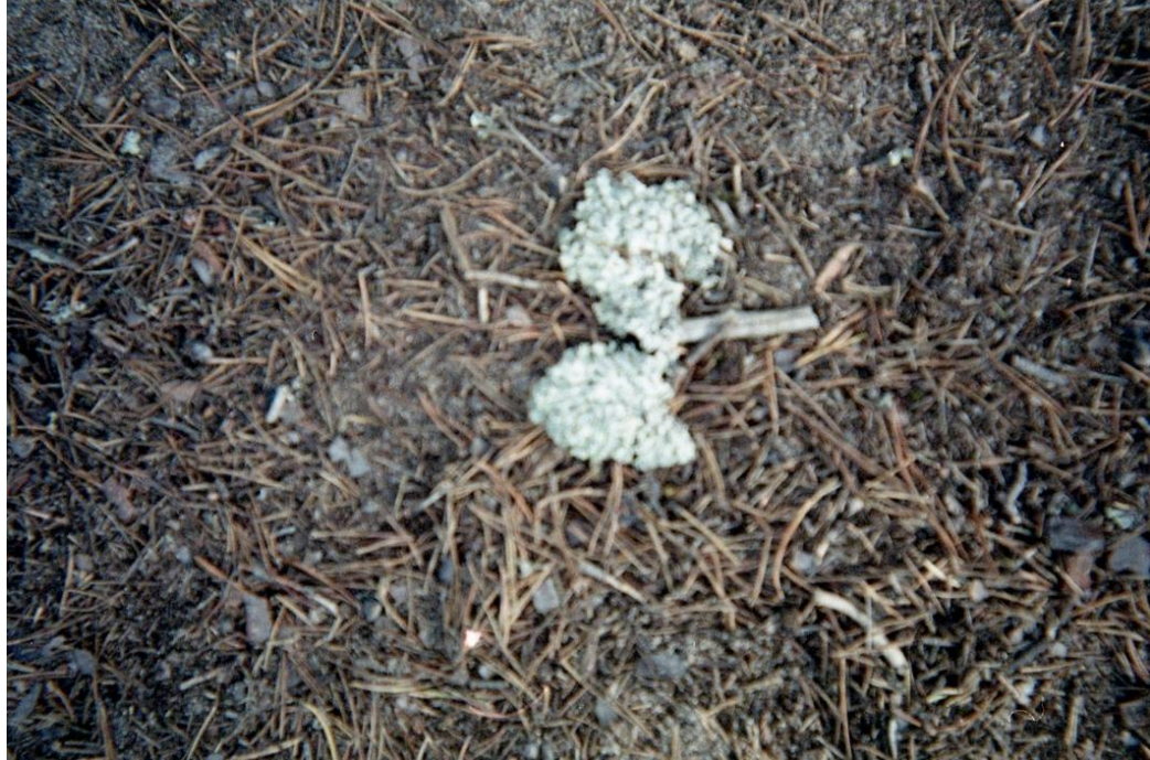
Image 1. From camera 77 by unknown participant. Do these tree lichen lungs depict anxiety about climate change? Is it harder to breathe? Is our planet suffocating?

A light shade of blue in the shadows of tree lichen.