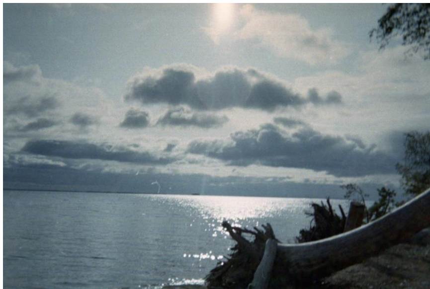
Image 10. From camera 62 by unknown participant. Blue. The sun finally revealed its beams of light and painted the whole landscape with a mysterious blue. It looks like scenery in a dream.

All we have is blue. The image is not manipulated, no filter has been used. The moment was blue, captured on film as it was.