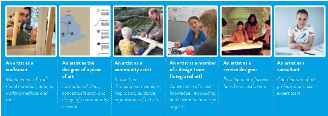
Figure 6. An artist's work description and related expertise in the context of environmental art and tourism environment.

in the artist's skills (Uimonen, 2010). While the skills of a traditional artist have been related to the implementation of the production, design skills and conceptual thinking are particularly emphasised in applied and integrated art (Figure 6). In place-specific environmental art, the artist operates simultaneously as an environmental researcher, designer, reformer and occasionally community artist.