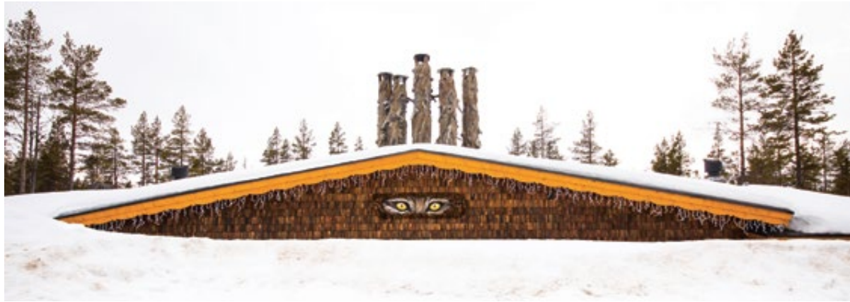
Figure 2. Kakslauttanen Arctic Resort. Relief on the wall by sculptor Essi Korva, 2016. Photo by Pertti Turunen 2018.

Northern Lights igloos and snow hotels are built for larger tourist groups as experience destinations. Such sites combine architecture and environmental art in an entirely new way while creating high-quality tourism environments that bring out the distinctive characteristics of Arctic nature (Figure 2).