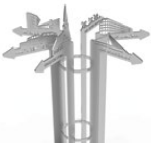
Majja Virtaala, Touch , 2013, can be categorised as applied visual art. It was a winner of an environmental art competition in the city of Rovaniemi. Artists and designers were asked to propose sculptural elements as a guide to cultural sites in Rovaniemi.