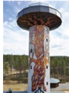
Essi Korva, Tree of the Past and Future , 2017, integrated artwork in Kakslauttanen Arctic Resort in Saariselkä. The work was commissioned by the tourism company.