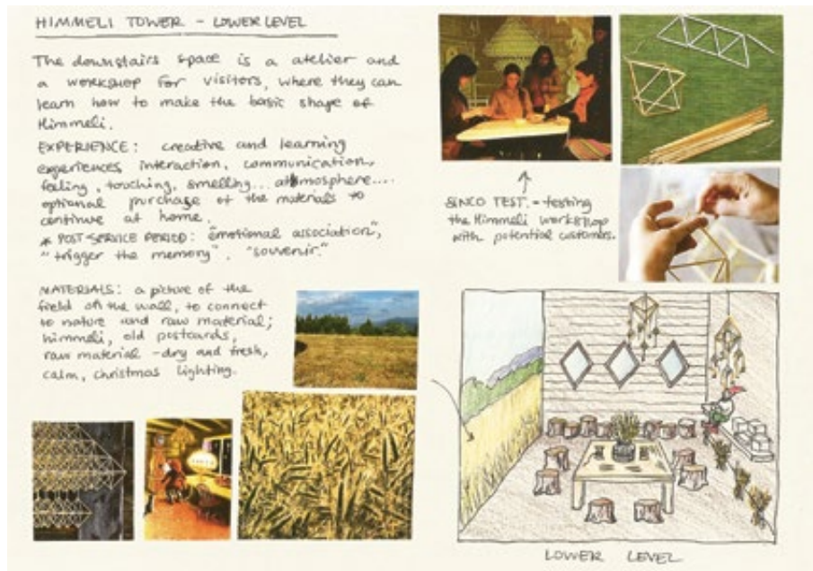
Figure 4. Concepts for arts and craft-based tourism services were design along the sites by Tanya Kravtsov. Photo by Tanya Kravtsov 2018.

The activities of applied visual art require close cooperation with people, future users, economic life and different sectors of society, which requires artists to have prior