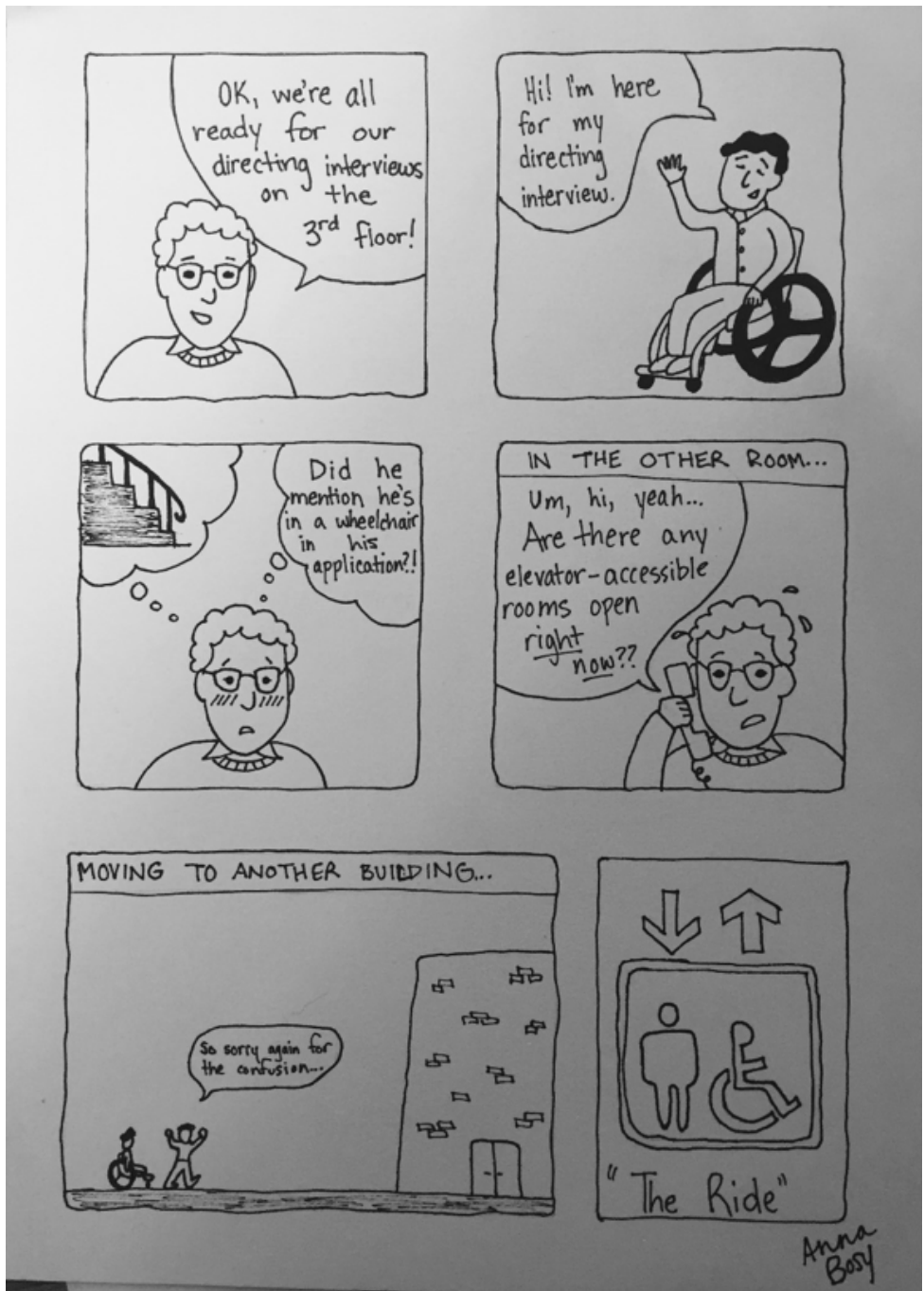
Figure 2: The Ride.

graphic novels and comics we had read for the course, suggesting that they had a broad understanding of what comics and graphic novels could look like. At the end of the semester, students