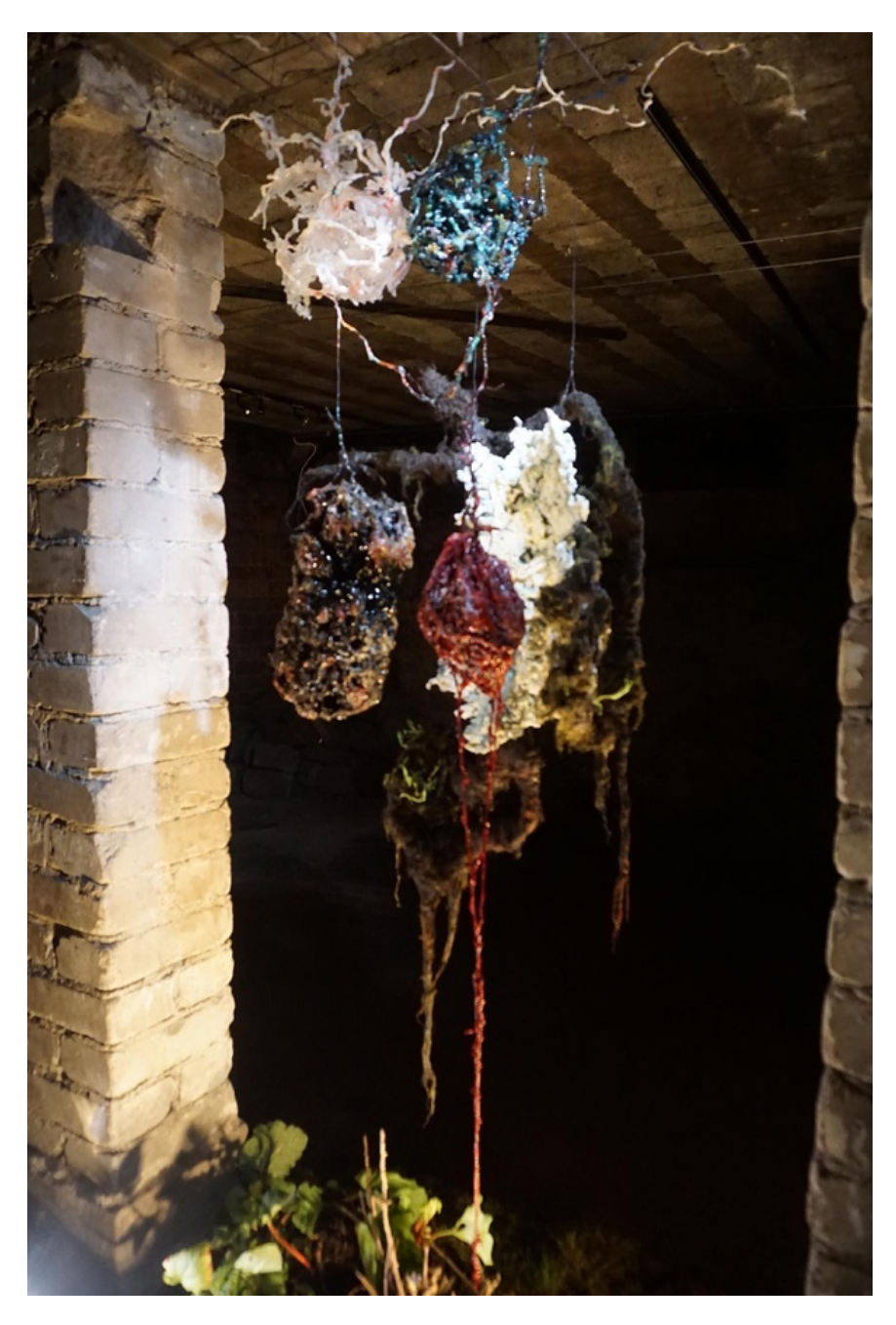
Figure 4. The material artefact, 'existent' between its edges.