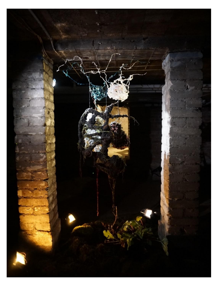
Figure 7. View from the backside of the installation.

The descriptions of the aesthetic and metaphoric content of the installation provided above, are subjective and perceived from the point of view of the artist, me. To others, the content may have been different. However, as I was present at the installation during the entirety of its run, I was also able to observe and interact with its participants throughout the exhibition period. The discussions that I engaged in were extremely valuable in observing what sort of engagement it provided. Although I never consciously interviewed any of the visitors that took part in the installation, I did engage in many meaningful discussions which I noted down, either by writing or recording soon after those encounters, as best as I could remember.