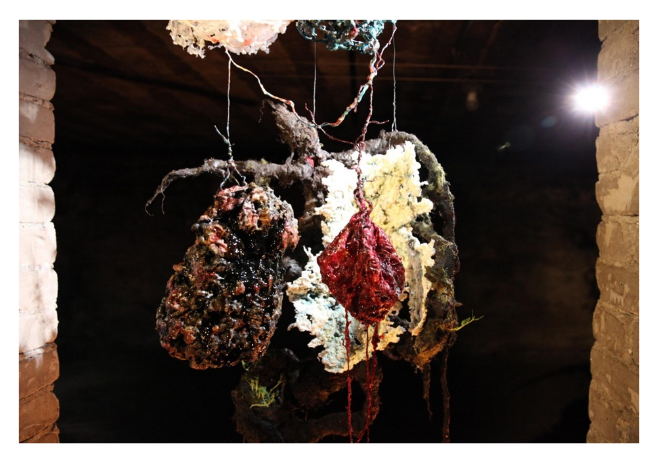
Figure 2. The composition of the heart and lungs.

The 'existent' was formed out of three slightly enlarged organs, framed with a decaying skeletal corpse behind them. The heart, lungs and brain are all components of human life, without which it cannot be sustained. Through witnessing how fragile these organs are and the effects their decay can have, I had become scared of them. For me, these organs were representations of my own mortality. In my work, I needed them to be exposed, to become visible and present. Aesthetically, I was constantly pursuing to balance the authentic with the imaginary and metaphoric through them. Trying to find an equilibrium with the organic and fleshy materiality that was both obnoxious and beautiful simultaneously.