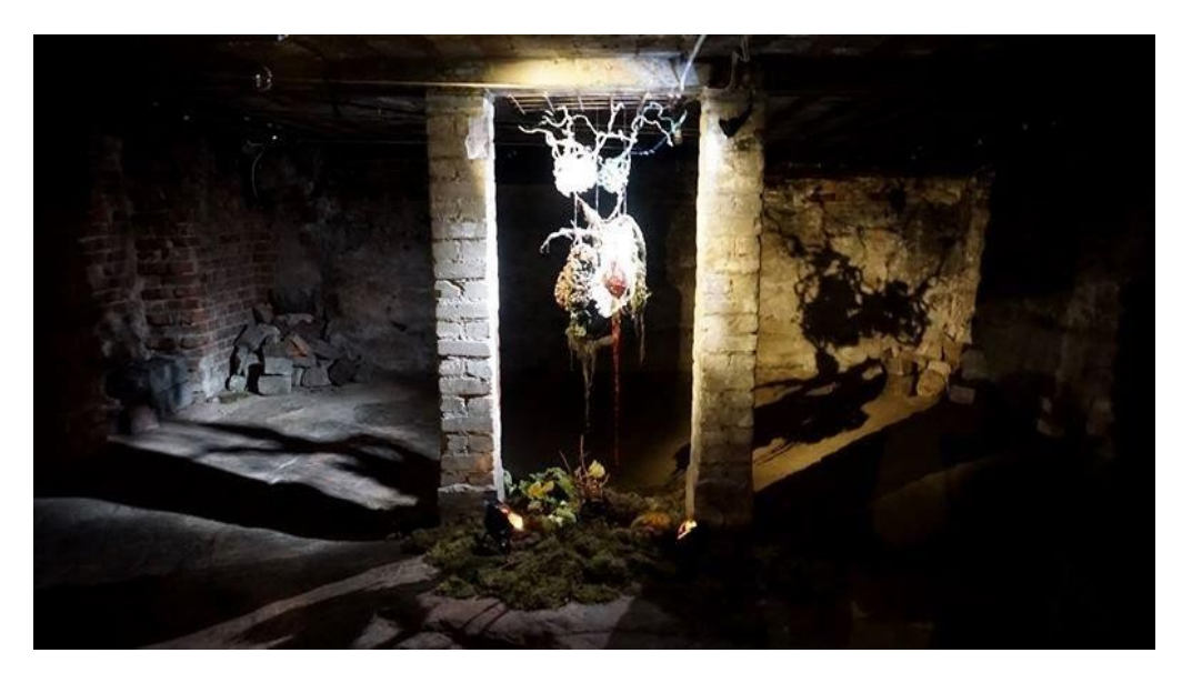
Figure 1. View from the doorway of the gallery space.

and other sensory information to create different layers of time and life related experiences in the installation. As the material artefact within the Edges of the Existent installation, which I will be naming the 'existent' hereafter, consisted of multiple tangible materials, the amount of visible and palpable information available for the participants of the exhibition was almost overwhelming, as many of the visitors pointed out.