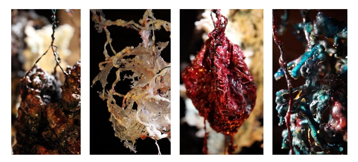
Figure 3. Close-ups of the individual organs and their materiality.

Exhibited at eye level and in proportion to the average height of a person, the 'existent' created a spatial connection with the viewer, which was the same as to a living person. The intent was that the positioning of the existent would create a mirroring effect, and the way the organs were presented would resonate in the body of those who saw it.