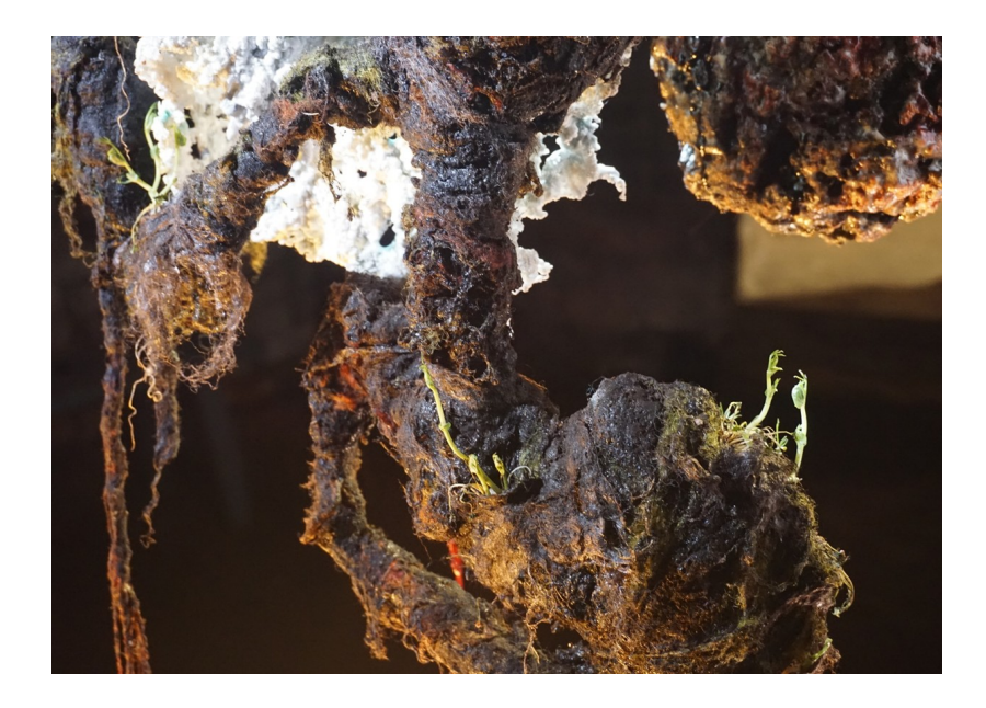
Figure 5. Close up of the sprouts growing on and through the 'existent'.

The circle of life was present through the temporal cycle of life that exists in all nature