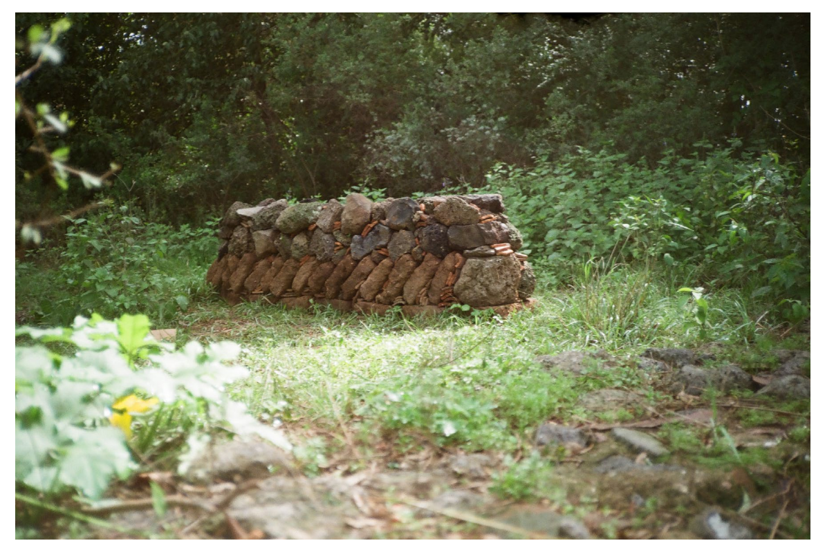
Figure 4. Rock and adobe wall construction

While we are fully aware of the ironies of using a human language to talk about a non-human entity, whose concept of language scientists have only the faintest idea about, we still find it important to practice including morethan-human methods in human practices, as the one of the first steps to decentralizing humans is to start considering, at a very base level, that humans have something to learn from other species. We are not suggesting anthropomorphism, so much as borrowing a