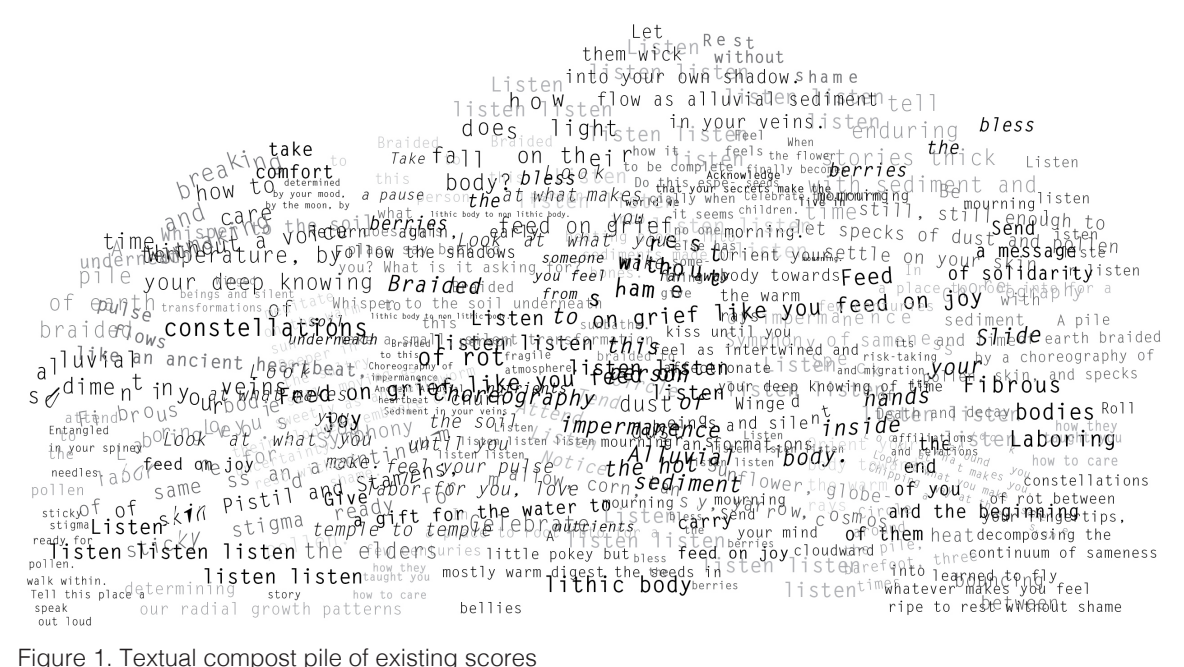
Figure 1. Textual compost pile of existing scores

sense-making of our visual inquiries. We agree with Pomarico (2016) that language, similar to pedagogy, shares a paradox that "reiterates a vertical, authoritarian experience, and, at the same time, offers the possibility of emancipation, freedom, and justice" (p. 209). We believe language, and its textual partner writing, are not static forms but organic, dynamic processes with the capacity for provoking discovery, and sometimes recovery, of relationships we did not know or forgot we had. Writing made to perform is "embodied, creative counter-speech" (Pollock, 1998, p. 74) that tests and practices language in evocative, radical propositions, and calls forth action. As a sense-making process, we experience performative writing as a way of becoming conscious of the medium, of considering the weight and materiality words carry in ourselves, and the living world. Words "do not live alone or in the mind" (Zapata et al., 2018, p. 492), they become world-makers. We understand performative words to operate between consequential meaning and rhetorical aesthetic; to contain a potent magic of potential action and response; to project alternative modes of thinking and being through reinterpretation of meaning and possibility.