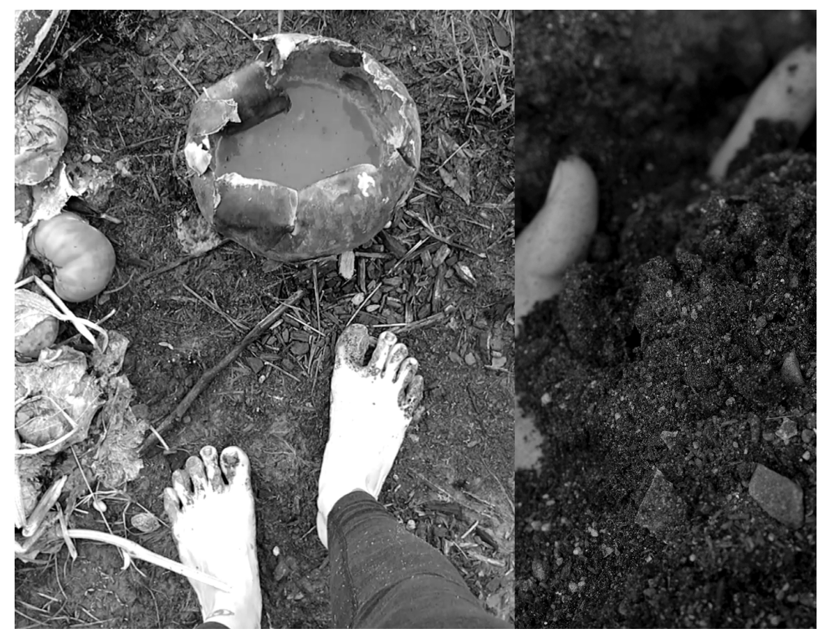
Figure 3. Score performances with compost