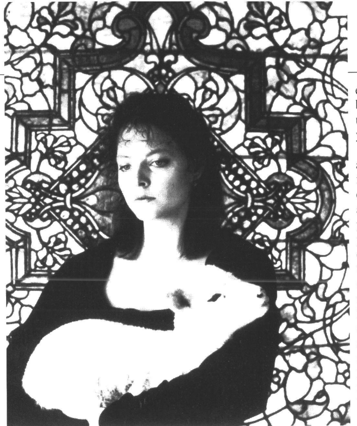
In The Silence of Lambs Clarice has to confront her past in order to find her true identity.