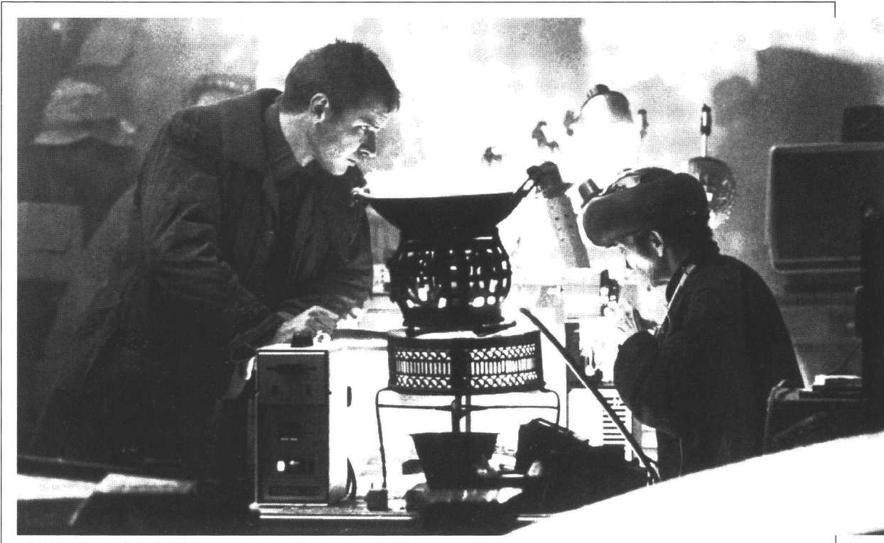
Ridley Scott, Blade Runner

Engines of Creation (1986). In this perspective nanotechnology for example means; engineering the protein molecules (amino acids) in such ways that building organic machines becomes possible. These machines then could assemble practically anything one wanted from a given set of molecules. Hence, in nano-utopia there would be no poverty, hunger, disease - or age: