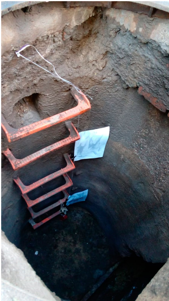
Fig. 1 Sticky traps placed in the Barcelona sewer system

(A260/280 ratio) were evaluated using a NanoDrop OneC spectrophotometer (Thermo Fisher Scientific, Waltham, MA, USA). DNA extraction quality was evaluated with an internal control PCR, using the primers LCO1490 (5'-GGTCAACAAATCATAAAGATATTG G-3') and HCO2198 (5'-TAAACTTCAGGGTGACCA AAAAATCA-3'), which amplify a cytochrome c oxidase subunit 1 ( COI ) gene [18]. The presence of a 600-bp band visualized by electrophoresis on a 1% agarose gel confirmed that the extracted DNA was of appropriate PCR amplifiable quality.