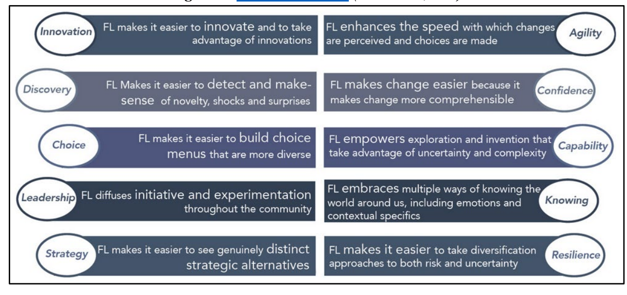
Figure 1. Futures Literacy (UNESCO, n.d.)

In the book Future Shock , Toffler (1970) noted that overwhelming complexity, speed, and content of change require learning, unlearning, and relearning. How does Extension develop futuring literacy and capacity? In the book Transforming the Future: Anticipation in the 21st Century , Miller (2018) provides a framework with attributes of futures literacy. The United Nations Educational, Scientific, and Cultural Organization (UNESCO) has demonstrated that people and communities everywhere can become more futures literate (see Figure 1). According to UNESCO, being futures literate empowers the imagination and enhances peoples' ability to prepare, recover, and invent as changes occur. Additional perspective was added by Häggström and Schmidt (2021), who advocated for empowering youth through futuring literacy, Kazemier et al. (2021), who addressed futuring literacy in the context of higher education, and Mangnus et al. (2021), who connected wicked problems and futuring.