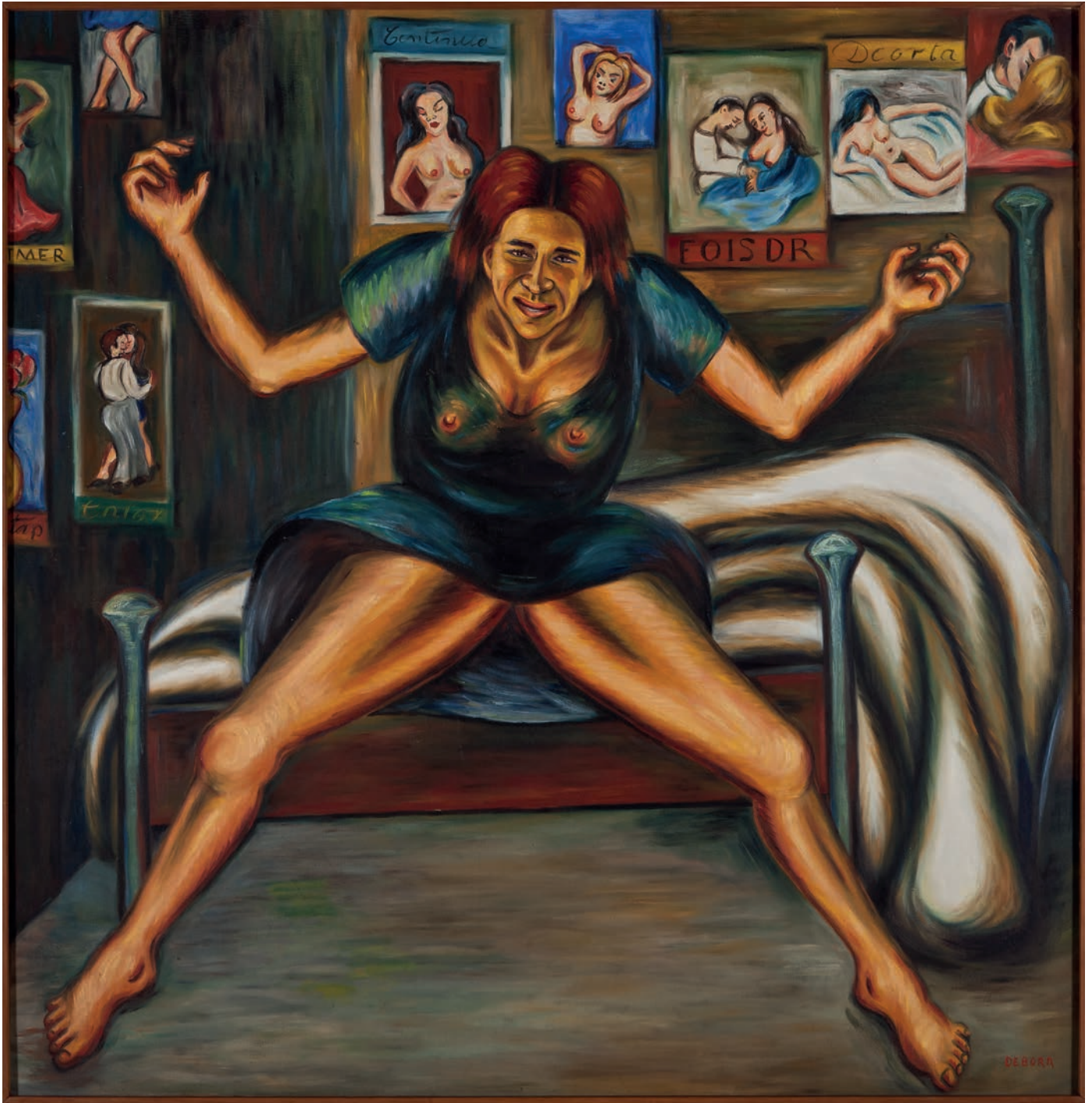
FIGURE 4. DÉBORA ARANGO, ESQUIZOFRENIA EN LA CÁRCEL (SCHIZOFRENIA IN JAIL) , 1940, OIL ON CANVAS, 162 x 165 cm. Museo De Arte Moderno de Medellín