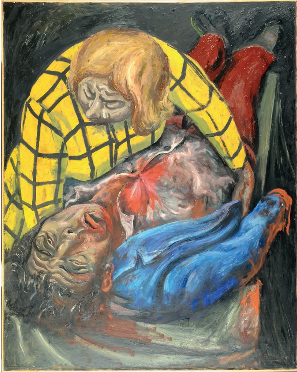
FIGURE 2. ANTONIO BERNI, EL OBRERO HERIDO ( THE WOUNDED WORKMAN ), 1949, OIL ON CANVAS, 200 X 150 CM. Museo Nacional de Bellas Artes, Buenos Aires

But she but does not explain the background of such influence or delve into its possible connections with later movements, such as the expressionist-tachist abstraction derived from the Week of 22 or the symbolic figuration that takes place between 1950 and 1970.