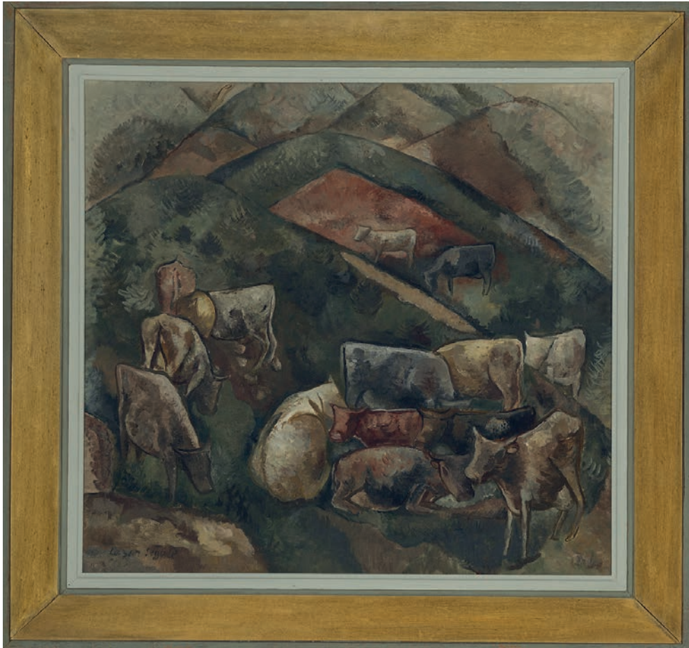
FIGURE 1. LASAR SEGALL, GADO NA MONTANHA (CATTLE ON THE MOUNTAIN), 1939, OIL WITH SAND ON CANVAS, 60 X 65 CM.