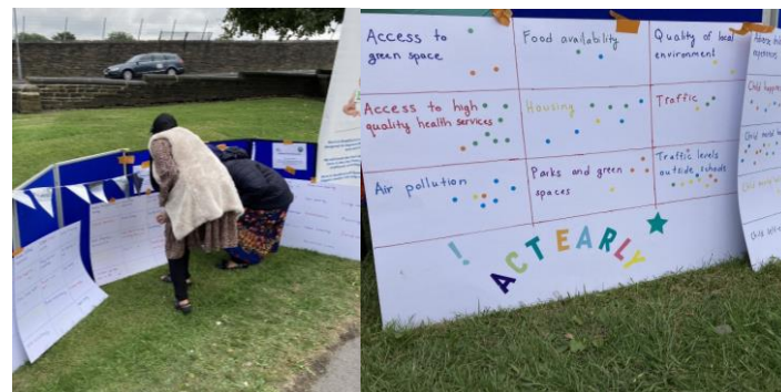
Figure 3. Community consultation in Bradford.

consultation with patients, or community members, is recommended when there is no clear consensus among the experts and it can ensure that outcomes are included that are important to community members [2]. The community member consultation was conducted using ‘dot voting’ and by utilizing principles of the nominal group technique, which facilitates quick, structured decision making [16–18]. In dot voting, participants are given colored dot stickers that they can use to indicate their votes in priority setting and consensus exercises. In addition to the ‘dot voting,’ we facilitated a play activity that children could engage in, whilst adults were asked to contribute to the core outcome consultation.