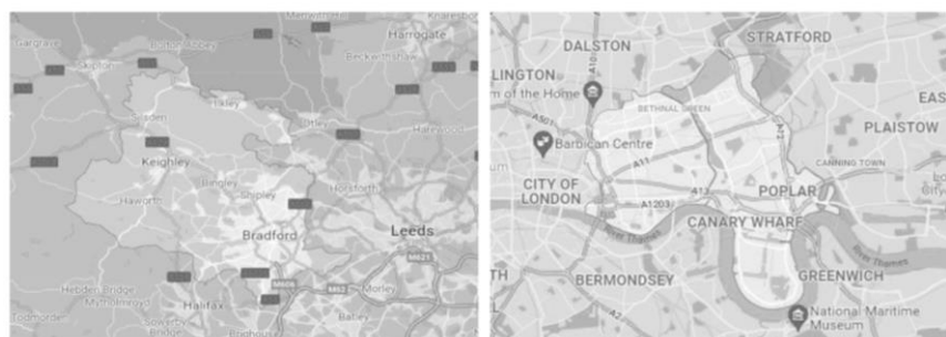
Figure 1. Maps of ActEarly study areas: Bradford Metropolitan District (left) and the London Borough of Tower Hamlets (right).

The populations that are the targets for the application of the COS-EY in the first instance were children and families living within the ActEarly study areas: Bradford Metropolitan Area in West Yorkshire and the Borough of Tower Hamlets in London (Figure 1).