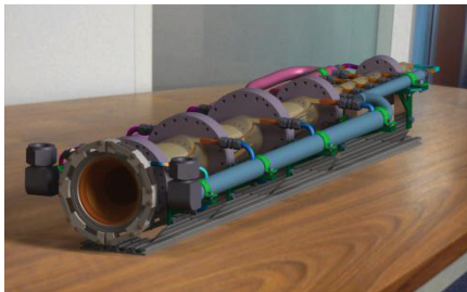
Figure 6 : Sketch of the 200 kW HEBT beam dump.

Specific calculations had to be performed to confirm that the heaviest elements fixation system, including the HEBT magnets, resist to a serious earthquake, avoiding any “missile” effect on the building walls and ground.