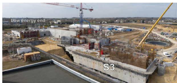
Figure 2: View of the SPIRAL2 phase-1 building construction (March 2013).

In March 2013, 92% of the concrete was poured (13000 m 3 ), thanks to 250 000 work hours, and up to 120 workers on site. Figure 2 shows the state of it.