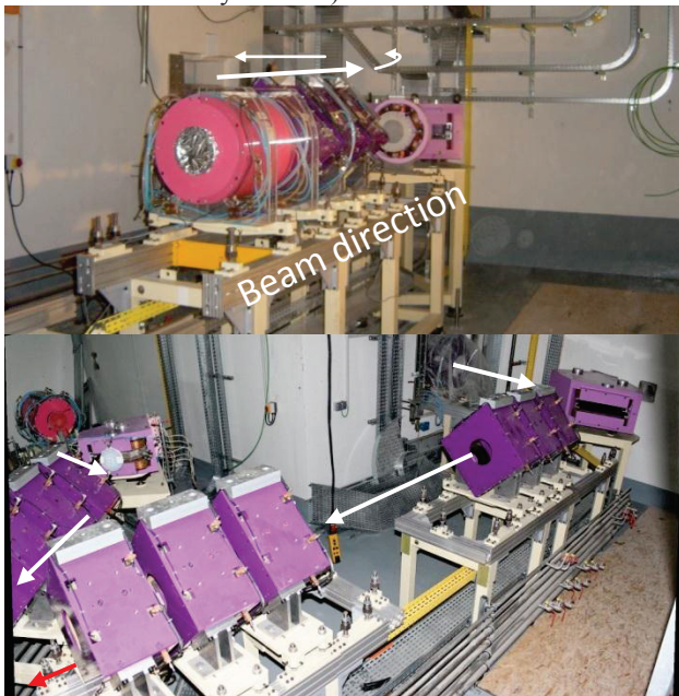
Figure 3: LEBT1 and LEBT2 installation.

A development program is also conducted to increase the volume of the plasma chamber and improve the magnetic configuration of the Phoenix source. (LPSC, GANIL and IPN/Lyon work).