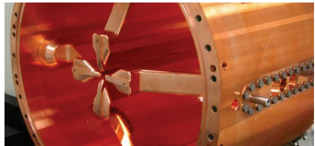
Figure 4 : RFQ end-vane details.

In parallel, the integration system of the RFQ segments is ready, and the cooling-tuning system call for tender launched.