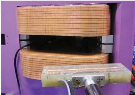
Figure 5 : Field measurements of HEBT dipole magnets.

The HEBT lines are now completely defined, with all dipoles constructed and being measured (Figure 5), while qpoles and steerers are under construction and the 200 kW beam dump call for tender achieved (Figure 6).