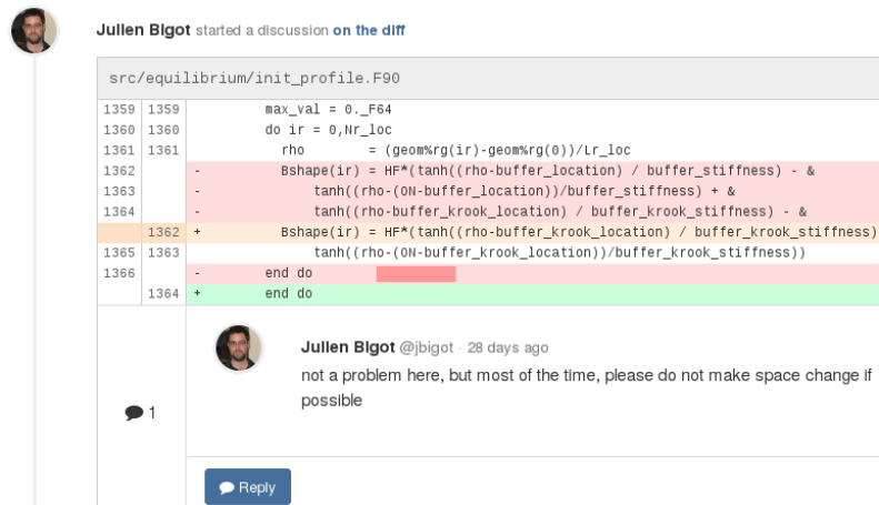
FIGURE 3. GitLab interface to comment on a specific line of code in a merge request. Lines highlighted in red are those removed by the merge while those in green are added. The stronger highlight is applied when only part of a line changes.

however not limited to integration tests but offer a unified way to describe any kind of test and to interface with multiple execution machines. Two such platforms are for example Jenkins or Buildbot 11 . GitLab also integrates a continuous integration tool known as Gitlab-CI, but in our opinion this is still too young and has not reached feature parity with other tools. In this paper, we base our examples on Jenkins.