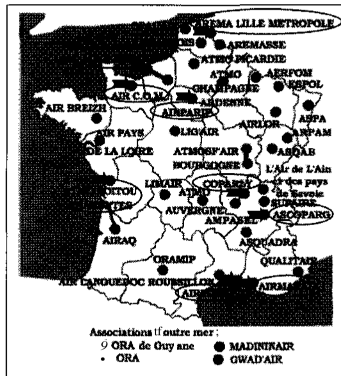
Figure 1. Air quality monitoring networks in France

The French Air Quality Monitoring Network (there are 40 different networks spread throughout France, figure 1), which was set up from the 1970's, is the response to this European strategy.