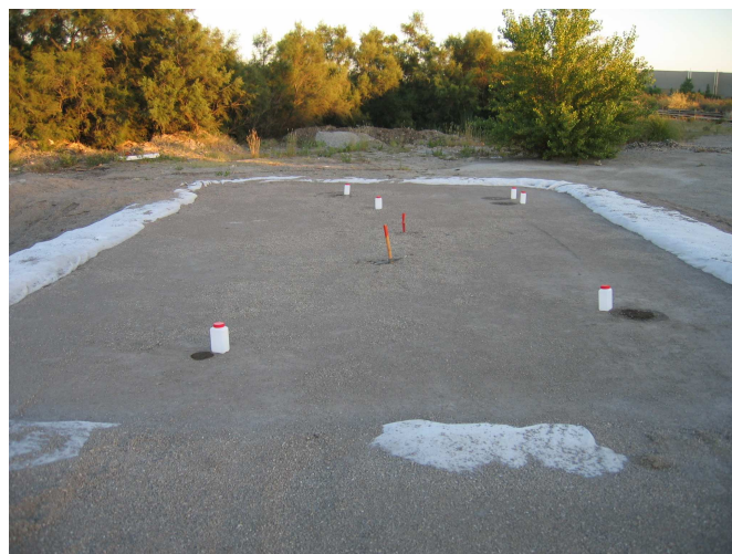
Figure 2. View of the experimental platform

The experimental site consists of an outside industrial platform, 10.9 x 6.4 m and 0.52 m thick, located in the southern part of France. The bottom of the work has been covered with a geomembrane and equipped with a drainage system in order to collect the stormwater percolating through the BOF slags. Two 0.26 m-thick layers of slags have been dumped in the platform and compacted (total mass about 70t). The bearing capacity of each layer was about 50 Mpa after compaction (plate-bearing test). The platform is unpaved and there is no traffic. The level of the water table is generally below 2 m at the site. The dry bulk density average 1.88 \text{ t m}^{-3} , which is not so far from the optimum proctor bulk density.