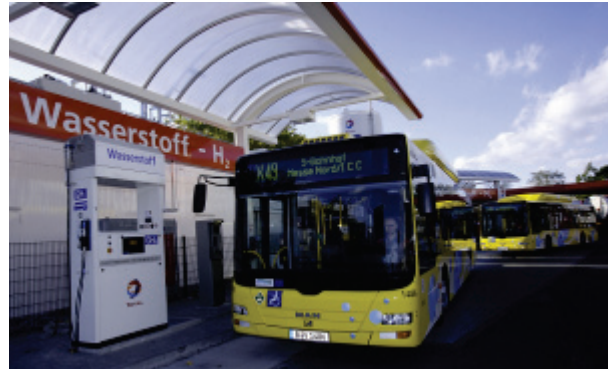
One of 14 hydrogen ICE Buses at the refueling station in Berlin

A very active and extensive dissemination and information programme – the Global Hydrogen Bus Platform – combined with the inclusion of Beijing, China, aims to extend the impact of this technology world-wide.