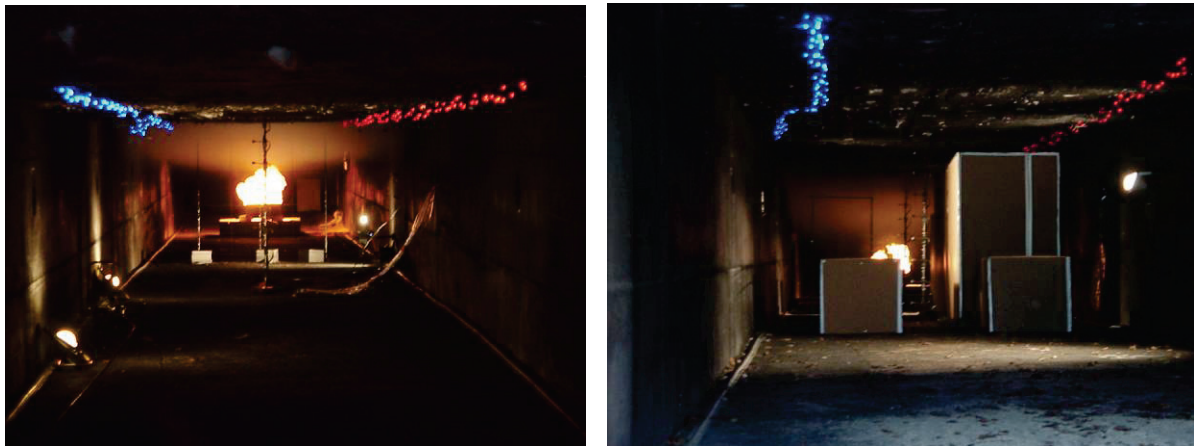
Figure 1: Photography's of the EGSISTES experiments. Left: Backlayering reference case, i.e. without disturbances. Right: Impact of vehicles.

The second part of the project was focused on the improvement of the physical phenomena understanding using both the experimental and numerical approaches. Experiments were carried out for fire, heavy gas dispersion and explosion. The first two phenomena were studied in the 1/3 rd scale INERIS fire gallery in order to study the interaction between the stratification and the ventilation. The impacts of disturbances on the smoke layer were studied using scaled vehicles and fan, photography's from experiments are reproduced on Figure 1. Explosion was experimentally studied in the INERIS explosion gallery. Two series of experiments were achieved for studying both solid explosion and flame propagation in an explosive cloud. For those different situations, the 3D simulation tools were used to enlarge the experimental results.