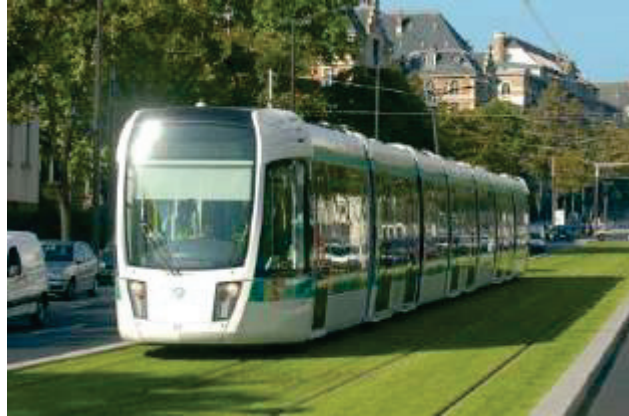
Picture of the tramway T3 in Paris.

RATP and Alstom have developed a series of tests that will last a whole year 2009 to test the technology based on ultracapacitors. The research and development project called STEEM will be launched following the equipment certification granted by the railway authority in France, Certifer. The equipments will be installed to the supply system of 21 Citadis trams and regularly tested on Line 3.