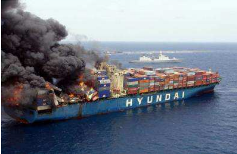
Figure 3: Fire in the Hyundai Fortune cargo ship

Among these accidents, very few deal with transport or storage of fireworks. The only known accident in a container ship is the HYUNDAI FORTUNE in 2006, 64 000 tonnes, bearing 5100 containers (in equivalent 20 feet), when an explosion near the YEMEN coast caused a fire that lasted several days. The ship had a cargo of 7 fireworks containers located in the area of the fire, but the actual cause of the incident remains poorly identified.