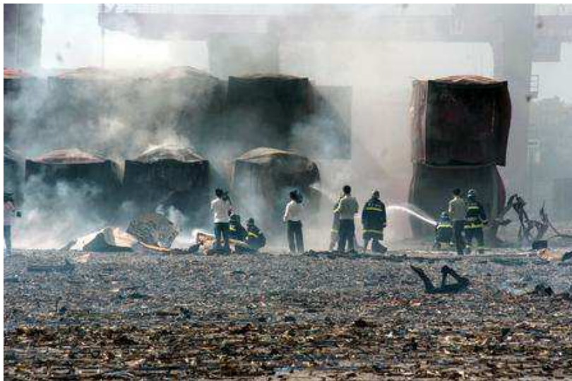
Figure 4: Fire in the Changsha harbour

Among recent accidents involving containers, the best-known is the one in the port of Changsha in 2006 where 200 containers have caused a significant fire after an explosion as initial event.