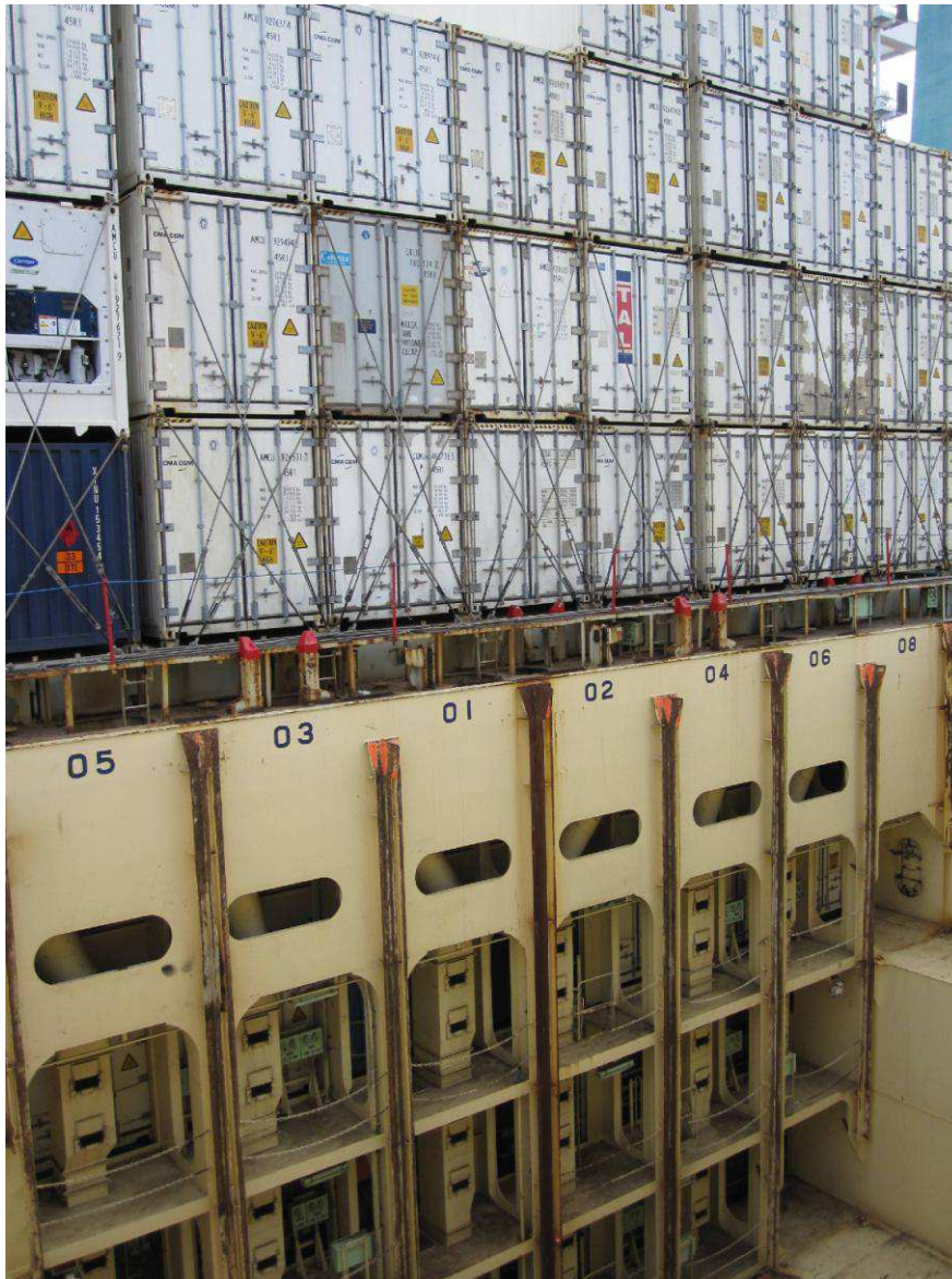
Figure 5: Containers above and below deck