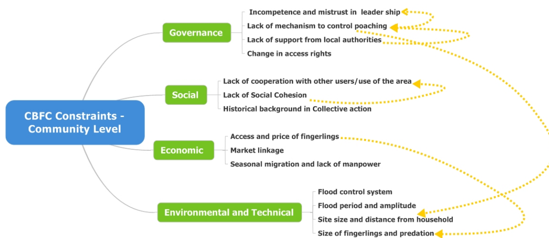
Figure 2: Diversity and interactions of constraint limiting the development of Community Based Fish Culture (CBCF) at the community level.

In the following section we analyze and discuss the different constraints limiting the adoptions of Community Based Fish Culture at community and household levels. The main constraints at the community level and their interactions are illustrated in Figure 2.