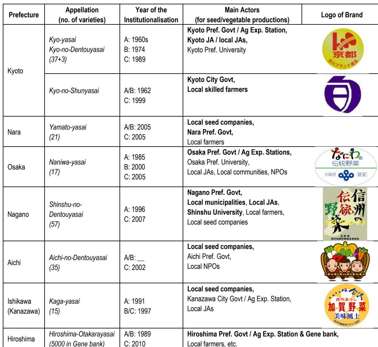
Table 1. Some Examples of Genetic Resource Use and Management of Local Traditional Vegetables

Note: A= Collections, evaluations, identifications of local traditional varieties; B= Genetic preservations (ex situ, field genebanks); C= Branding and marketing promotion