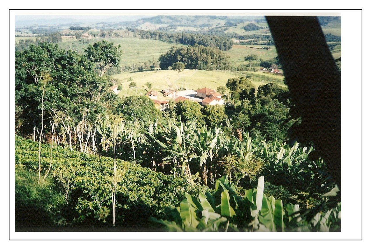
Figure 2. Coffee plantation of a AAOF associate