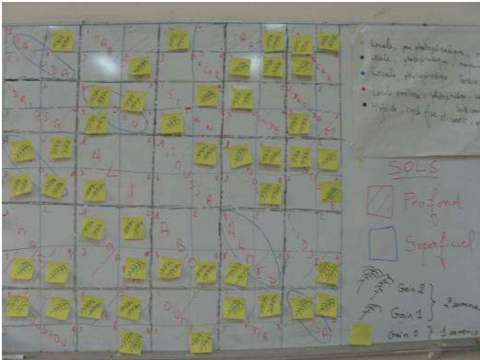
FIG 2 : Display of fields and harvest level on white board