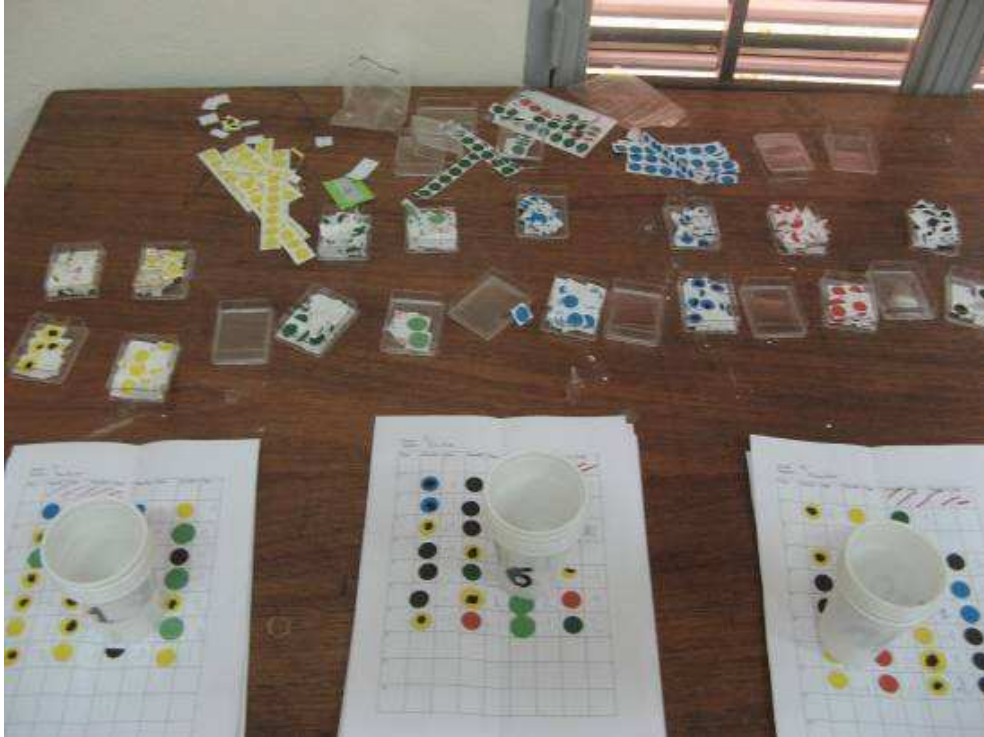
FIG 1 : Assitants table with reserves of seeds at the back and at the front players sheets with their choices for several years and players cups with seeds inside ready for being distributed back