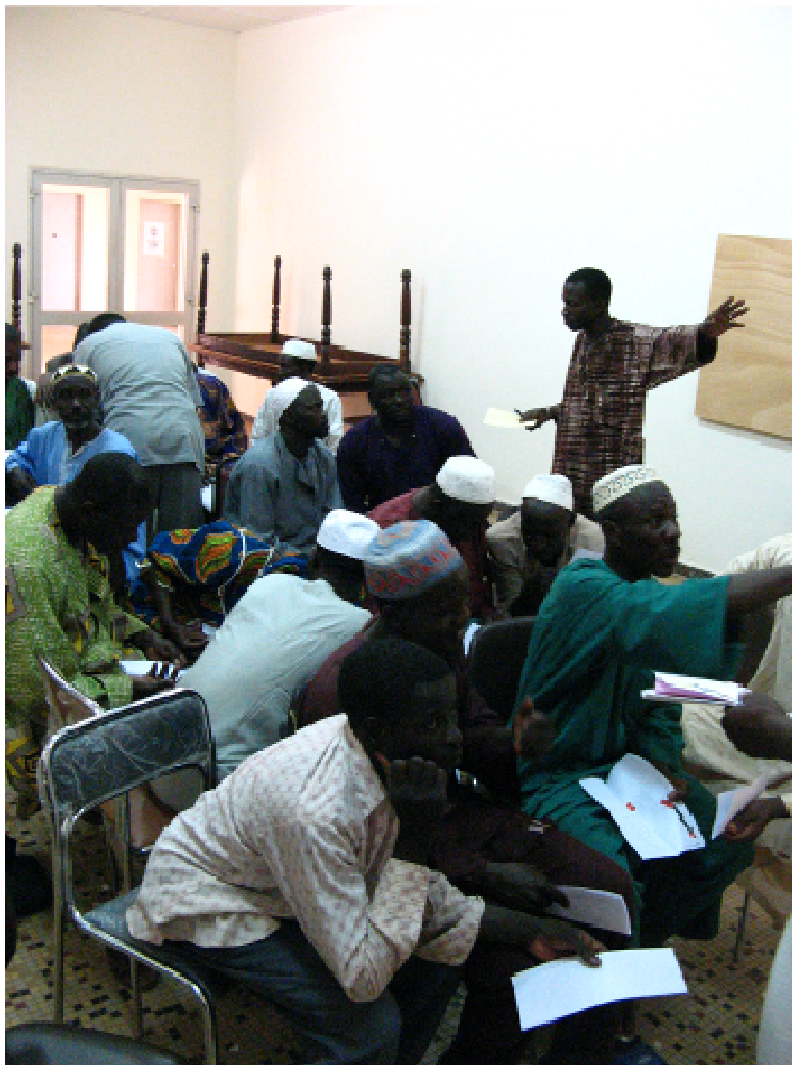
FIG 4 : Lines of players interacting and discussing