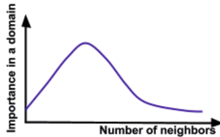
Fig. 1. Importance of a term in a domain

This approach aims to improve the precision of the top k extracted terms. As mentioned above, in contrast to the work cited before, the graph is built with a list of terms obtained according to the steps described in Sect. 3.1, where vertices denote multiword terms linked by their co-occurrence in the sentences in the corpus. Moreover, we apply the hypothesis that the term representativeness in a graph, for a specific-domain, depends on the number of neighbors that it has, and the number of neighbors of its neighbors. We assume that a term with more neighbors is less representative of the specific-domain. This means that this term is used in the general domain. Figure 1 illustrates our hypothesis. The graph-based approach is divided into two steps: