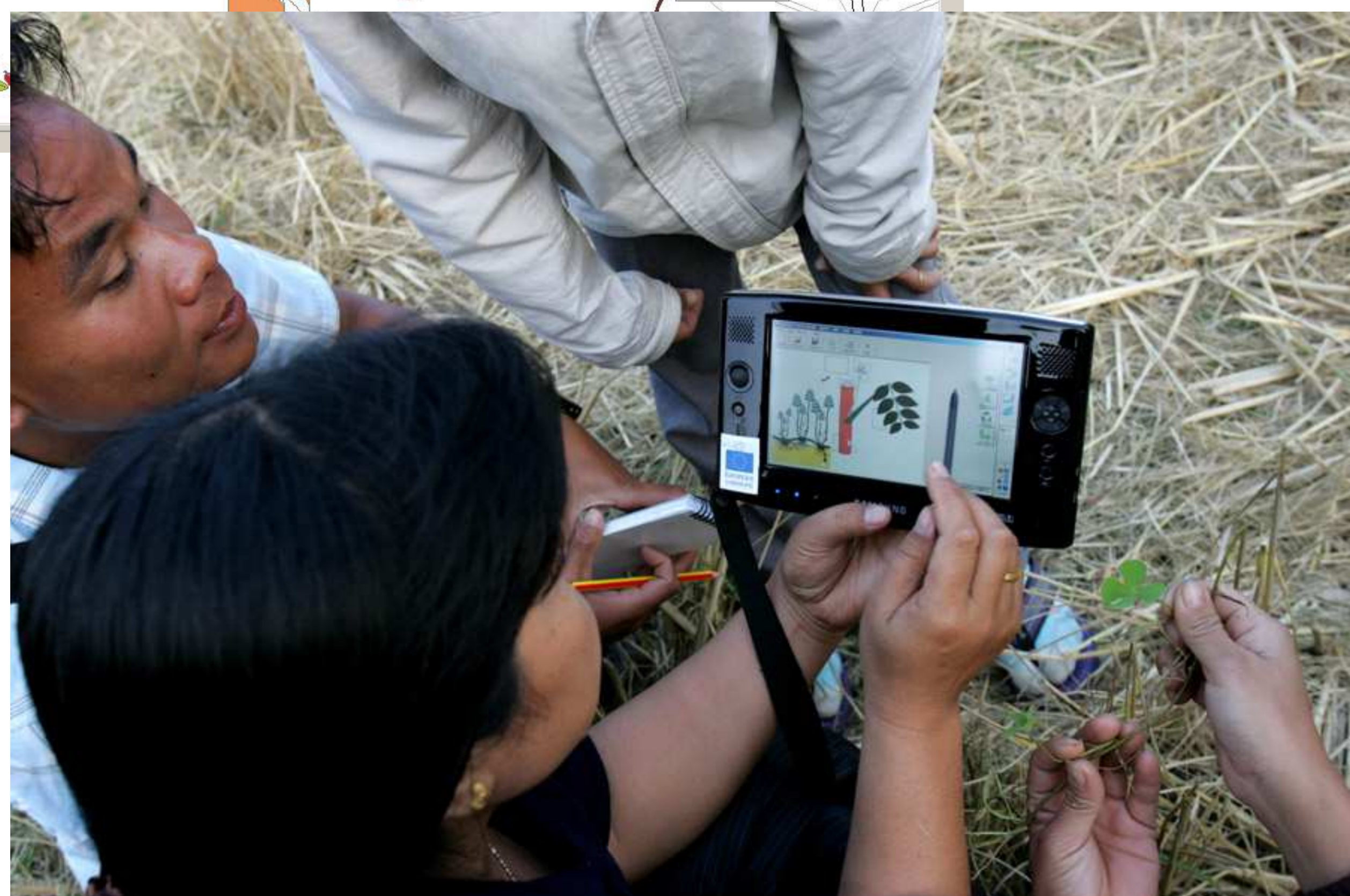
Tree species identification software running on a mobile device