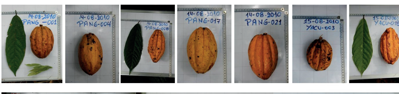
Photo 1. Cocoa fruits (pods and seeds) showing the diversity among some collected materials.