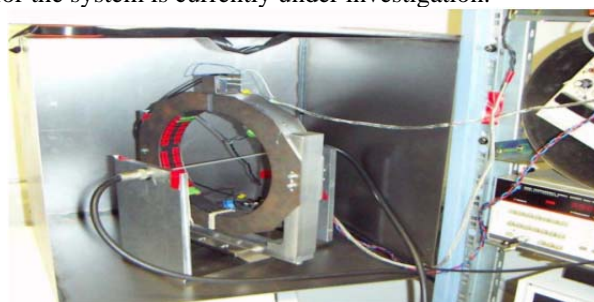
Figure 2: N-DCCT Test Setup.

Tests were carried out for two different TMR sensors, MMLH45F and MMLP57F. Figure 3 shows the output voltage of the N-DCCT versus input current for the MMLH45F. The slope of transfer characteristic is the sensitivity of the N-DCCT. The measured value from the experimental test is 0.566\text{V/A} , while the theoretical value is 0.75\text{V/A} . The sensitivity of the TMR sensor to the magnetic field is 0.453\text{V/mT} from the measurements and 0.6\text{V/mT} from the sensor's datasheet. Measurements with the sensor type MMLP57F yielded a sensitivity of 0.275\text{V/A} , compared to 0.31\text{V/A} (datasheet). The noise analysis for the system is currently under investigation.