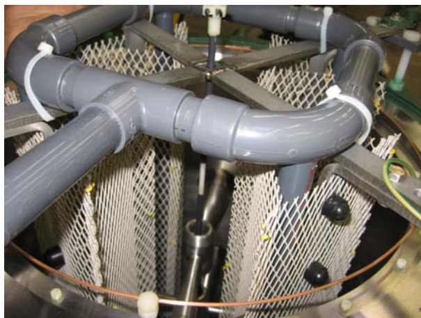
Figure 1: A CH-Cavity prepared for the Electroplating.

To comply with the requirements a couple of dummies were produced and copper plated before processing the prototype cavities.