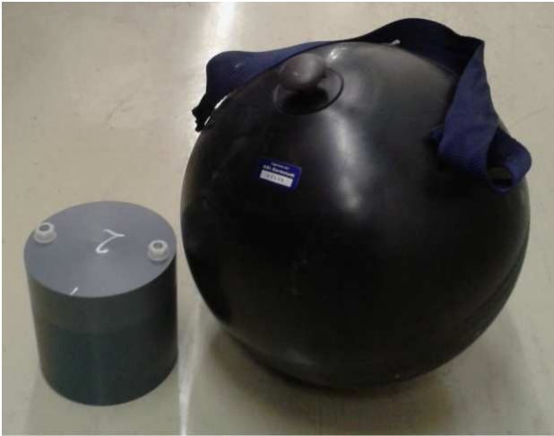
Figure 3: Neutron Dosimeters: ANDREA, type 5 (left) and GSI ball (right).

overall absorption and increases the total signal. Still a slight under-response in the vicinity of 10 MeV and over-response in the low energy region remain and are the issues for further improvements. The name of this type 5 dosimeter is ANDREA = A N eutron D osemete R for E fficient A rea monitoring.