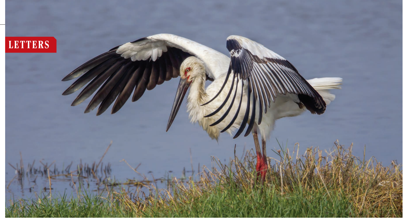
The Oriental stork (Ciconia boyciana) is threatened by human activities in its migratory stopover points in China.