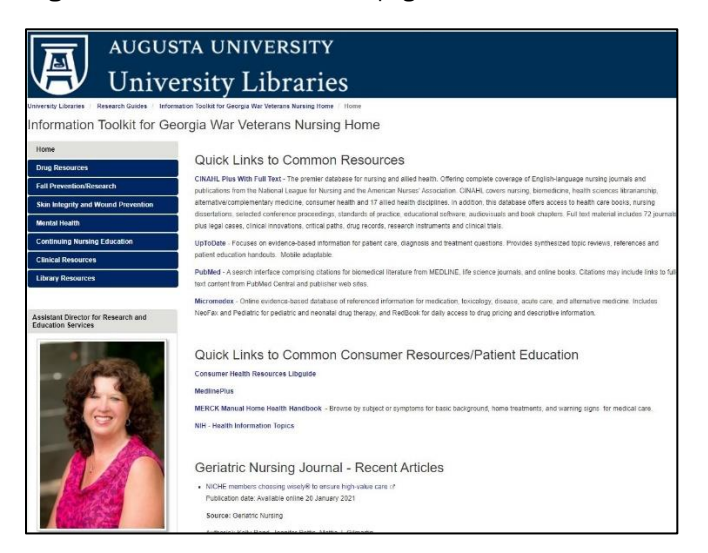
Figure 2 Information toolkit home page

Beyond the home page, the tabs are organized based on the common health issues that nurses frequently treat or need information about, such as drugs and vaccinations, fall prevention and research, skin integrity and wound prevention, and mental health. The nurse administrators asked specifically to include information about vaccinations, as this is an area about which the staff nurses need to keep current. In the topic areas of fall prevention and research and mental health, librarians from the Greenblatt Library at Augusta University created preconfigured searches in relevant databases, so the nurses can access the current journal literature on the topic with just one click.