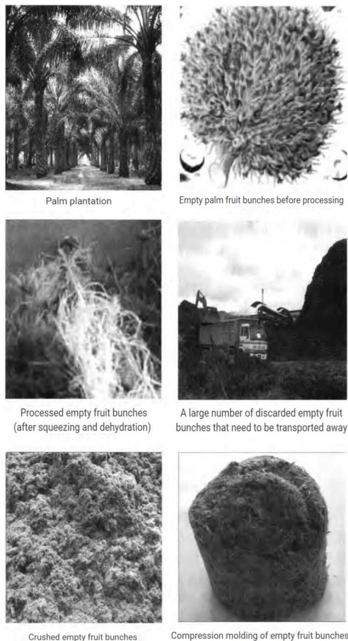
Figure 1. Processing of palm fruit bunches

Pictures of oil palm biomass fuels are shown in Figure 1 (These pictures are collected from the Internet).