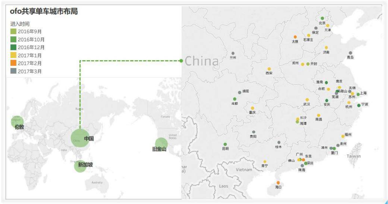
Figure 4: ofo bike city layout (Image source: 2017 China Bike Sharing Industry Research Report)

In 2019, three companies were identified through public bidding to carry out shared bicycle business services in the six districts of downtown Guangzhou, with operating quotas of 180,000, 120,000 and 100,000 vehicles respectively, and an operation period of 3 years. Mobike (now Meituan Bicycle), Hello Bicycle and Qingju Bicycle won the bids and obtained the above three different operating quotas respectively. The effect of controlling the total amount is obvious. The disorderly over-investment of enterprises has been effectively controlled, and the total number of vehicles in the six central districts has been reduced from more than 1 million vehicles at the peak period to about 400,000 vehicles. There has been a marked improvement before.