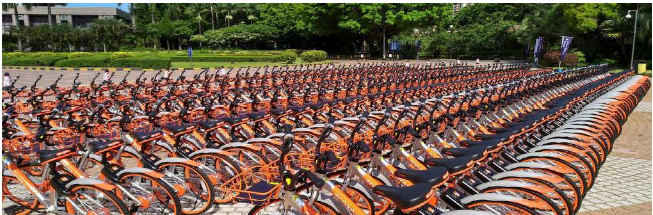
Figure 6: Shared bicycle