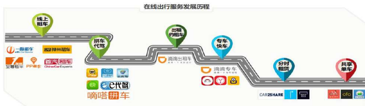
Figure 1: Development history of online travel services