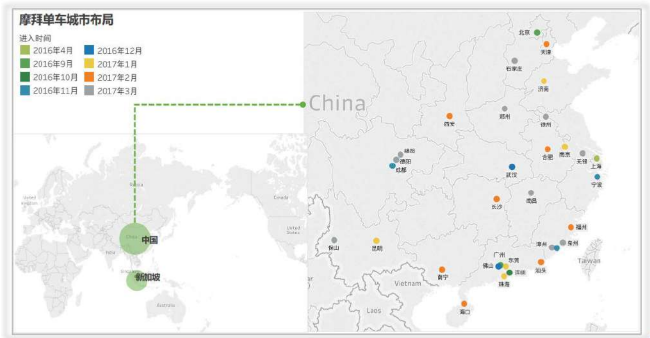
Figure 3: Mobike city layout