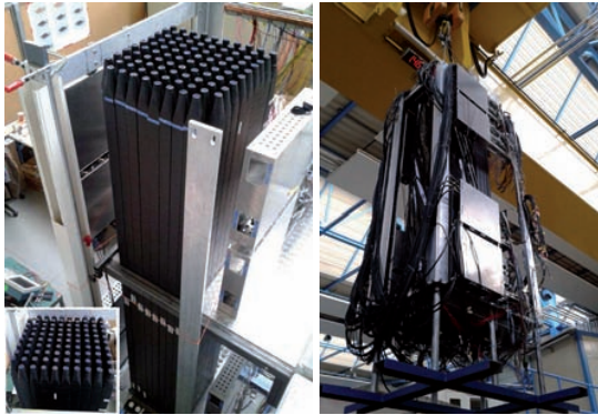
Figure 1: NeuLAND test array: after insertion of 100 scintillator bars (left) and transport of the assembly including 150 bars and its readout electronics to Cave C (right).

In late autumn the experiment S406 in Cave C was carried out using deuteron beams for calibration and benchmarking of both the existing LAND detector [4] and NeuLAND prototypes. For the latter 150 NeuLAND bars were mounted in a special array with 15 layers of ten vertical bars each. The bars in the array have been tested using cosmic rays, and in the best cases a time resolution of \sigma_t^{Cosm.} = 130 ps has been reached. The photographs in figure 1 detail the assembly and transport to Cave C prior to the beam time.