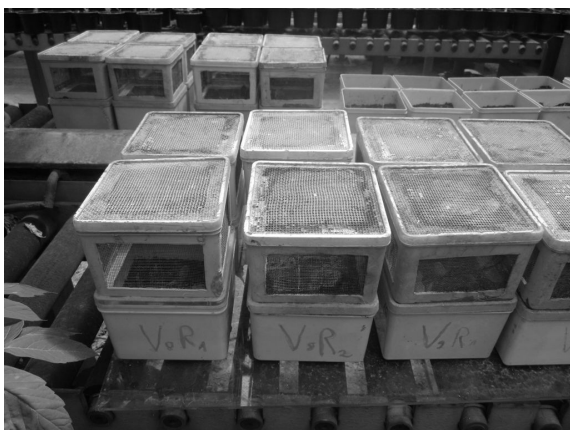
Figure 1 Plastic pots with isolators

Data from table 1 show higher insect mortality values in case of plants emerged from maize seeds treated with thiametoxan (Cruiser 350 FS) and clothianidin (Poncho 600 FS) in dose of 4.0 l/t. At variant treated with tiacloprid (Sonido), only 25 % of insects died after 8 days from plant infestation.