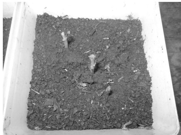
Figure 4 Maize plants destroyed by T. dilaticollis , at control (untreated) variant

thiametoxan (Cruiser 350 FS) the attack intensity difference comparative with first assessment are slight. At this variants, insect mortality peek occur after three days from plant infestation. At eight days most of the insect added in plastic pots are dead or affected. As result the insect rest alive don't feed with leaf and attack don't evolve. Contrarily at variant treated with tiacloprid (Sonido) insect mortality have low values, and many insects from plastic pots continue feeding with maize leafs. As result attack intensity increasing comparative with first assessment. At eight days from plants infestation with maize leaf weevil, attack intensity on a scale from 1 to 9 was of 7.66. Most of the plants have leafs chaffed in proportion varying from 75 to 100 % and at some plants, insects starting feeding with stem. More then 50 % of the maize plants from this variant can't recover.