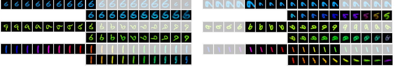
Figure 2. Forward predicted trajectories from the Predictive Coding TVAE (left) and the original TVAE (right). The images in the top row show the true input transformation, with greyed out images being held out. The lower row then shows the reconstruction, constructed by starting at \mathbf{t}_0 , and progressively rolling the capsules forward to decode the remainder of the sequence. We see the PCTVAE is able to predict sequence transformations accurately, while the TVAE forward predictions slowly lose coherence with the input sequence.