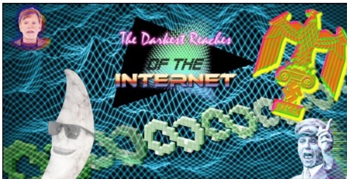
Image from Daily Stormer's A Normie's Guide to the Alt-Right (Anglin, August 31, 2016)

past future of "cyberpunk". Grafton Tanner (2016) offers an intriguing reading of the genre's ironic nostalgia for an imagined past future of the web as a meditation on the "uncanny" relationship between ourselves and our tools. What Tanner refers to as the "uncanny" and "haunted" vaporwave sensibility is built out of repeating fragments of the detritus of earlier digital culture. In Tanner's reading, vaporwave's endless haunted loops foreground the mechanical processes underway in the formation of contemporary subjectivity online. Grafton's argument is essentially that vaporwave brings one closer to the machine , opening human being onto the alterity of techne — a theme much discussed in contemporary media theory (see: Peters 2015). Here we can establish that, in spite of the apparent resemblance between vaporwave and fashwave as suggested by Ubermorgen, their philosophical outlooks are fundamentally antithetical. Whilst vaporwave exposes the machinic elements of human consciousness leading us away from the human form, fashwave seeks to construct a "new man" by awakening a "proto-fascist consciousness" (Theweleit 1987).