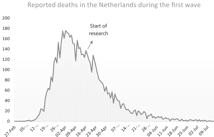
Figure 1: Number of deaths due to COVID-19 reported by municipal and regional health services by date (RIVM 1 July 2020)