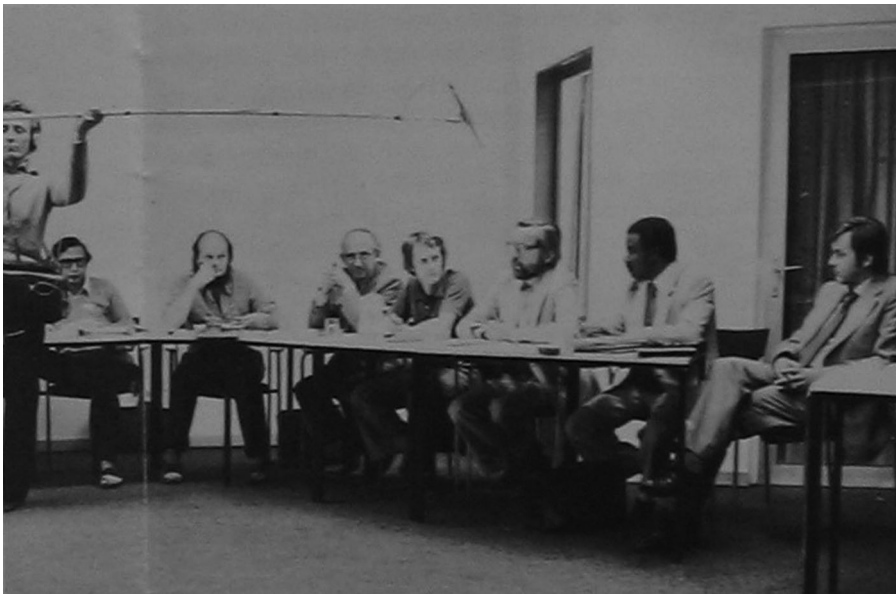
Figure 3. Representatives of producer groups and alternative trading organizations during the final meeting of the international conference on alternative trade in Noordwijkerhout, 1976. Wereldhandel , 11 (1976): 17.

The international ambitions of SOS had resulted in a Europe-wide network of alternative trading organizations which kept in close contact despite the organizational splits of the 1970s. They had also catalyzed the development of a network of relations between South and North. Through a series of international meetings, producers and members of alternative trading organizations had come to know each other (see Figure 3). 66 Even as these meetings served to become familiar with what kind of products were available and what kind was in demand, they were also platforms for debates about the goals of alternative trade. The politicization of the humanitarian