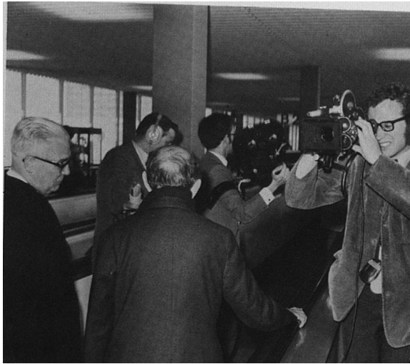
Figure 2. Dom Helder Câmara is met by the press upon his arrival in the Netherlands, 1970. Filius, Helder Camara in Nederland , 12.

matter of justice – obligatory rather than optional. 46 Such statements had been reinforced during the 1960s by people like Raúl Prebisch, the Argentinian general secretary of UNCTAD, who in 1968 had demanded ‘either reforms or your necks’. 47 They were popularized among Northern solidarity activists through liberation theology, which was first disseminated through networks of progressive Catholics, eventually gaining an interdenominational following. 48