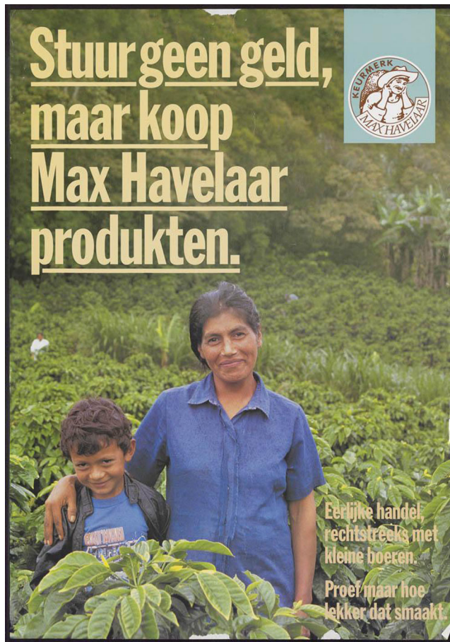
Figure 4. 'Don't send money, buy Max Havelaar products' – poster to a Max Havelaar campaign from the 1990s, Private Archive Max Havelaar.

Nowhere is this more evident than in the ambiguous use of the notion of justice, which had clear religious connotations, but extended into secular contexts too.