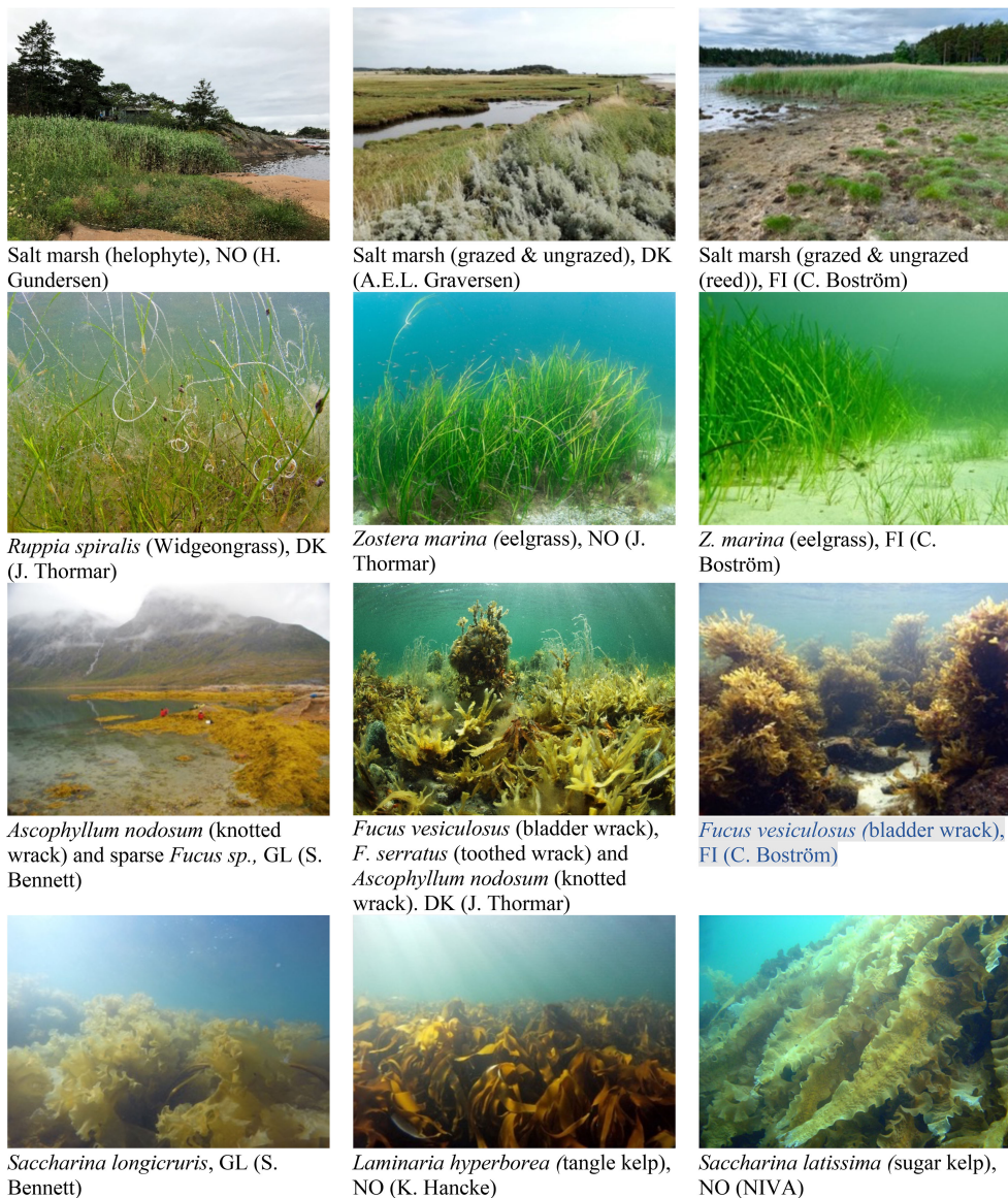
FIGURE 1 | Examples of characteristic Nordic BC habitats: Salt marsh (1 st panel), rooted vegetation such as seagrass (2 nd panel), intertidal macroalgae (3 rd panel), and submerged macroalgae, such as kelp forests (4 th panel).

particularly Fucus species dominating the shallow/tidal zone and Laminaria - and Saccharina -dominated kelp forests ( Figure 1 ) with understory vegetation being abundant in the marine subtidal (e.g. Fredriksen et al., 2005).