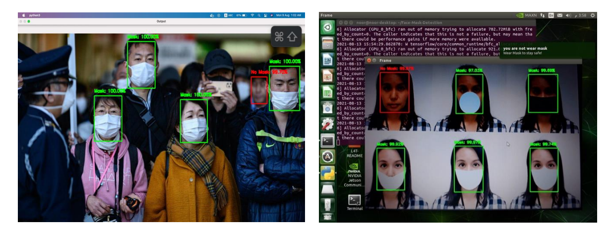
Figure 4. Predicting input data on MacBook