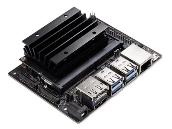
Figure 3. NVIDIA Jetson Nano developer kit

The model is invoked using the NVIDIA Jetson Nano shown in Figure 3. The face detection method is activated once the USB camera scans the images or real-time video. If a face is spotted, the procedure moves on to the next step. On detected frames identifiers, reprocessing is done, which includes decreasing the picture size, transforming it to a matrix, then the input is pre-processed using MobileNetV2. After that, the stored model is utilized to predict the input data. Enhance the model for predicting the processed input image that has been previously created. Also, the video frame includes the person's image in a mask and the percentage they believe is likely. A buzzer sounds or beeps when no mask has been seen.