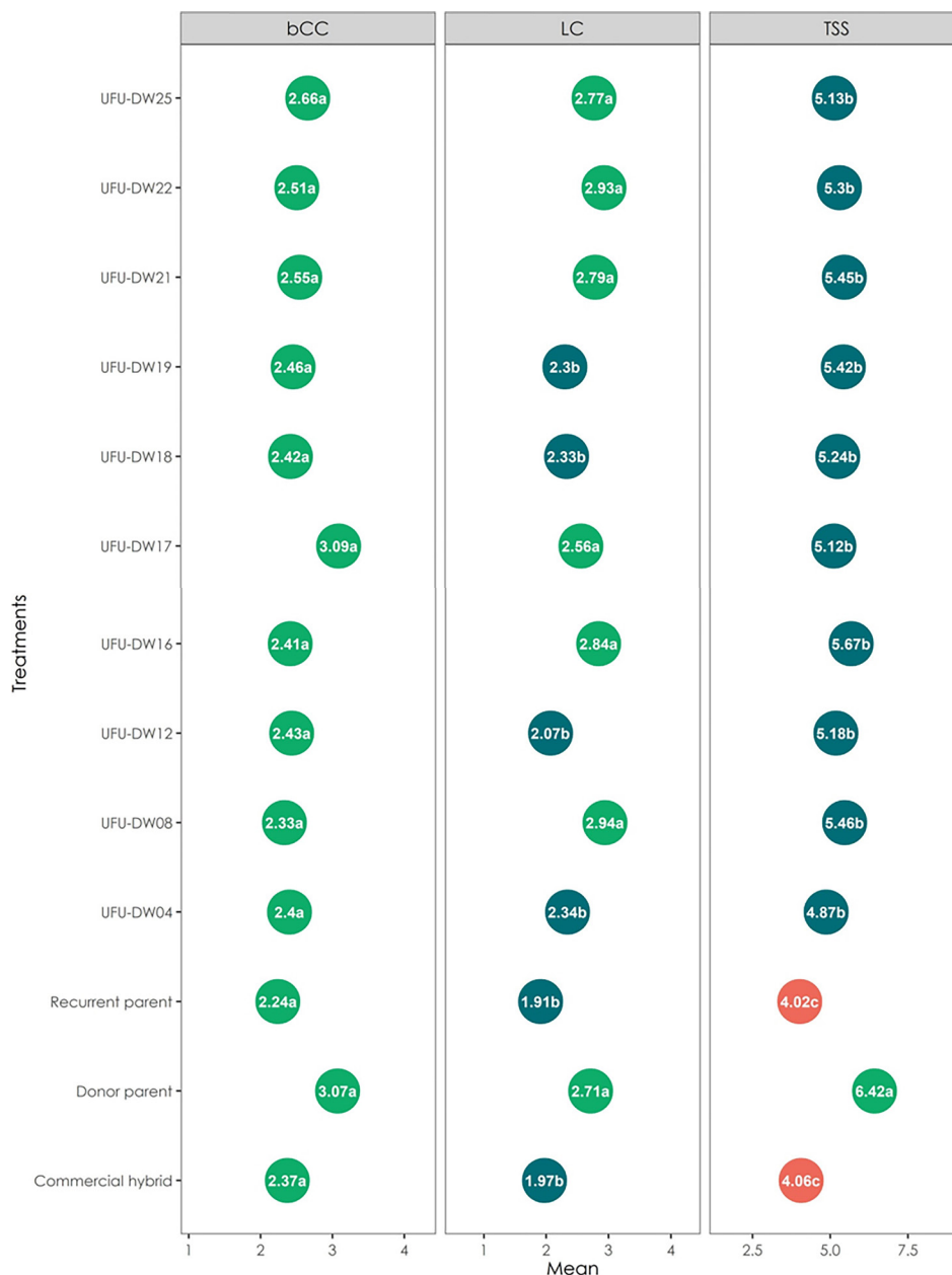
Figure 2. \beta -carotene (bCC), Lycopene (LC) and Total soluble solids (TSS) content in the BC_1F_3 dwarf tomato populations, recurrent parent, donor parent, and commercial hybrid. Mean values followed by different letters differ from each other by the Scott-Knott test at 0.05 significance.

soluble solids content, possibly through regulation of the genes that codify enzymes of sugar metabolism. In the present study, achieving higher lycopene and soluble solids content was made possible by the genetic variation of the genotypes, without requiring more complex biotechnological techniques that involve gene manipulation.