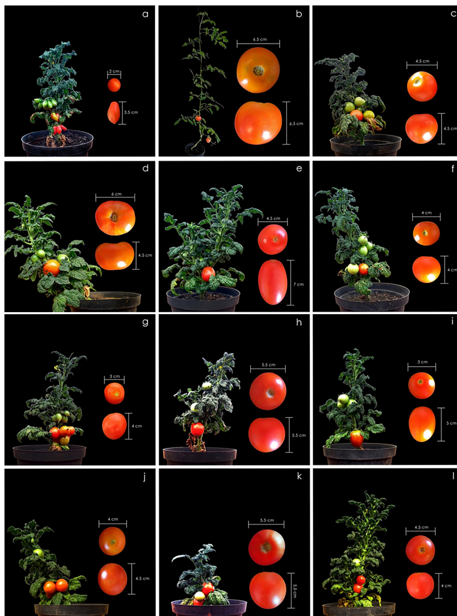
Figure 1. Comparison between the phenotype of the parents (donor and recurrent) and the BC_1F_3 dwarf populations. The fruit that is shown best represents each treatment. a: donor parent, b: recurrent parent, c: UFU-DW4, d: UFU-DW8. e: UFU-DW12, f: UFU-DW16, g: UFU-DW17, h: UFU-DW18, i: UFU-DW19, j: UFU-DW21, k: UFU-DW22, l: UFU-DW25.