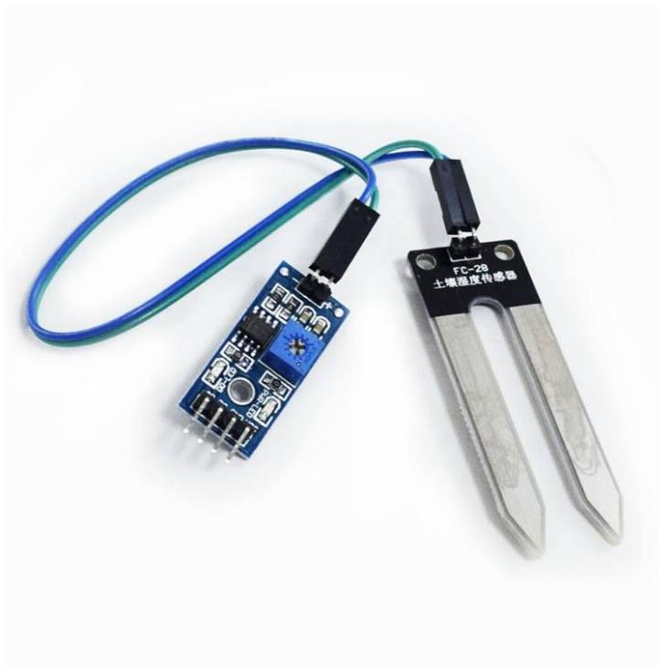
Figure 1. Soil Moisture Sensor

a result of they need sensible| reaction time (almost fast measurements), don't need maintenance, and may give continuous readings through automation. Though these sensors are supported the insulator principle the varied varieties out there or accessible (frequency domain reflectometry-FDR, capacitance, time domain transmission-TDT, amplitude domain reflectometry-ADR, time domain reflectometry-TDR, and section transmission) gift necessary variations in terms of standardization needs accuracy, installation and maintenance needs and value.