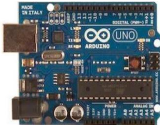
Figure 2. Audrino Board