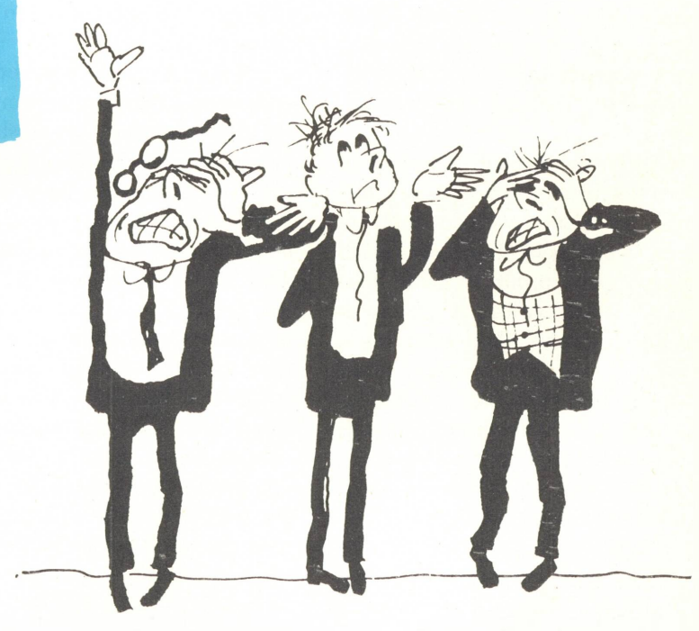
Costing a product before it is offered leads to the decision as to whether to offer it at an anticipated market price or discard it entirely.