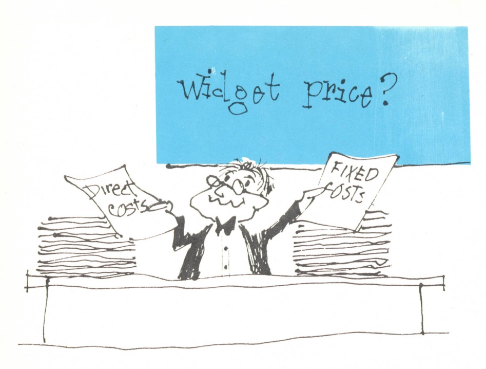
The frantic balancing of "direct" costs against "fixed" costs as a means of establishing a final price can result in a product that loses money.

ing costs are charged to operations as they are incurred.1