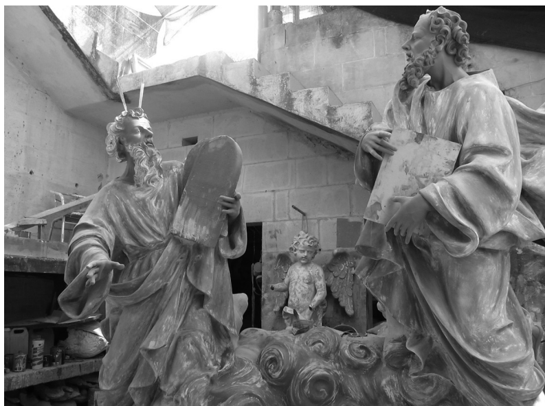
Photograph 7.3. Work-in-progress statues in Paul Aquilina's workshop, July 14, 2010.

tioned to the yearly cycles of festa, and at the time, he was hurrying to complete a commission featuring three figures to be picked up for display on Malta. As I looked at the busts shaped in clay amongst the plaster mixes and wire frames in his hot, dusty studio, I was struck by the detailed, expressive faces that spoke to the undeniable talent of their maker.