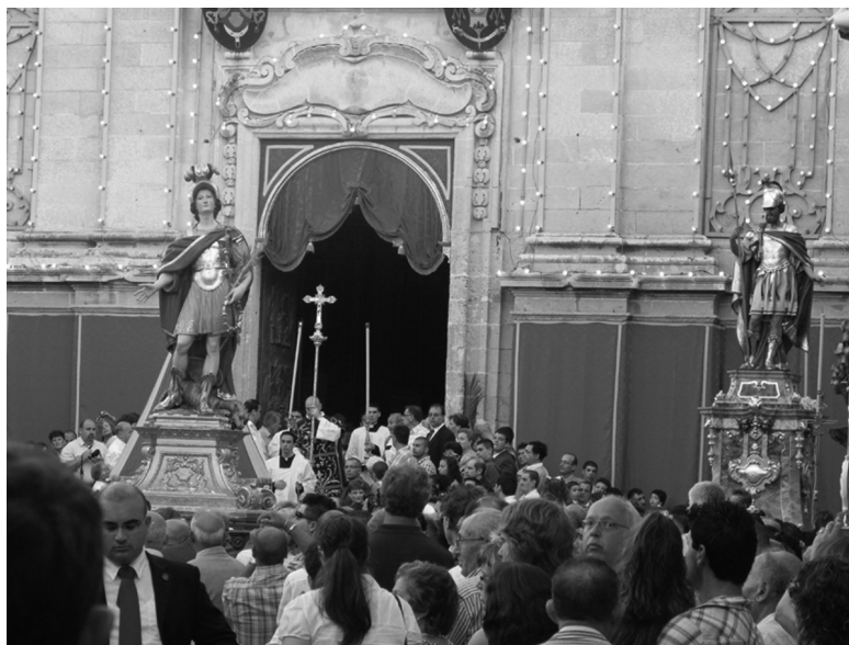
Photograph 7.5. Festa procession carrying the statue of St. George (San Gorg) in Victoria, July 18, 2010.

By examining the ways in which the parameters of “art” were defined in the first Gozo International Contemporary Arts Festival, it is possible to glimpse a portion of the truly abundant activities of artists and artisans working and creating on Gozo and Malta. The tensions between global and local present in the international artists’ definitions of art, and the separation between local traditions and the activities of the International Contemporary Arts Festival, ultimately speak to broader dynamics of globalization occurring throughout the Maltese islands today.