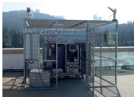
Figure 1. Measurement site with multiwavelength lidar Polly XT at the rooftop of the Electrical Engineering building of Technion.

The multiwavelength Raman and polarization lidar Polly XT [3, 4] was installed in Haifa in March 2017. The measurement site is located at N32.8°, E35.0° and has a height above sea level of 230 m. Since Haifa is a coastal site, the closest distance to the sea is about 4 to 5 km. Figure 1 shows the lidar system on the platform as well as the sun photometer on the right top of the safety fence around the system.